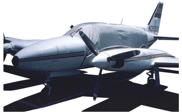
Piper Navajo Canopy Cover