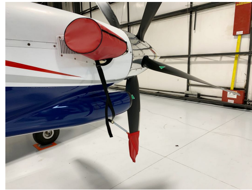
Piper PA-31T Cheyenne II Prop Tie-Downs/Exhaust Covers