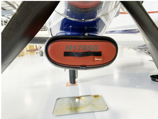
Piper Cheyenne Engine Inlet Plugs

Engine Inlet Plugs are custom fit for your Piper PA-31T: Cheyenne, Cheyenne II XL intakes, made with heavy-duty vinyl material, and stuffed with a single block of sculpted urethane foam. Each plug has a zipper that allows the foam to be removed and dried if necessary. Engine plugs have warning flags that are visible from the cockpit or 'remove before flight' streamers sewn onto the face of the plugs. Most plugs are imprinted with the aircraft registration number in black for an extra charge. Storage bag NOT included. Engine plugs may be inserted after flight when the engine is still warm. Engine Inlet Plugs are commonly referred to as Cowl Plugs, Intake Plugs, Cowl Blocks, Engine Blocks, and Engine Bungs.