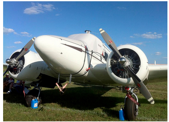
Beech 18 Cockpit Cover & Carb Inlet Plugs