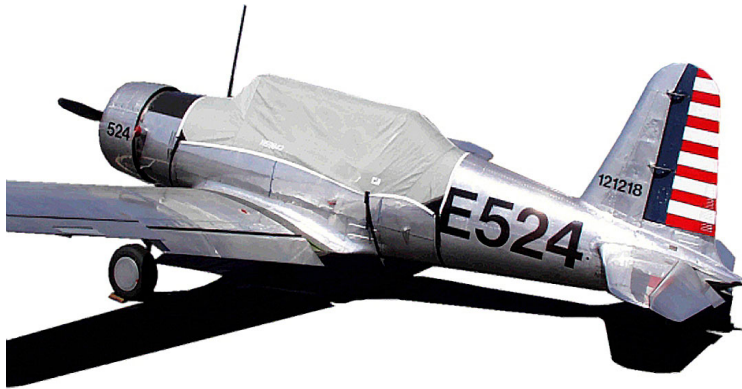
BT-13 Canopy Cover

This cover type is made from Silver Acrylic Sunbrella canvas and is 100% lined with a soft and smooth microfiber. Bruce's Custom Covers developed this material combination especially for aircraft protection. The outer material is medium weight and treated for water resistance, UV resistance and anti-static buildup. The inner lining is a very soft and smooth microfiber to prevent scratching. The material is very reflective, and tests show that the cabin interior temperature can be reduced to near-ambient temperature on the hottest of days. It is water, ice and snow repellent, yet breathable to allow moisture to escape from between the cover and the aircraft surface.