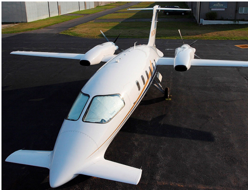
Piaggio 180 Cockpit HeatShields