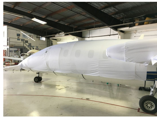
Piaggio P180 Fuselage/Canard Cover & Wing/Engine Covers (test fit covers)