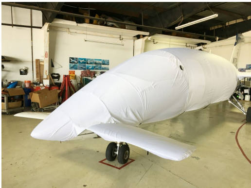
Piaggio P180 Fuselage/Canard Cover & Wing/Engine Covers (test fit covers)

WINTER USE MATERIAL - Made with Solution-Dyed Polyester fabric, this option is intended for seasonal use to aid in deicing, rain mitigation, or for occasional travel. The material is lighter and more compact, but more susceptible to UV damage and may have a shorter useful life if used continuously outside than the all-year use material.