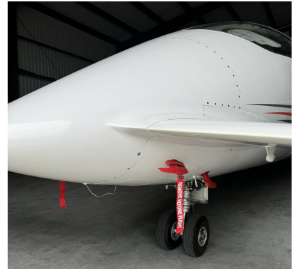
Piaggio P180 Pitot & Probe Covers