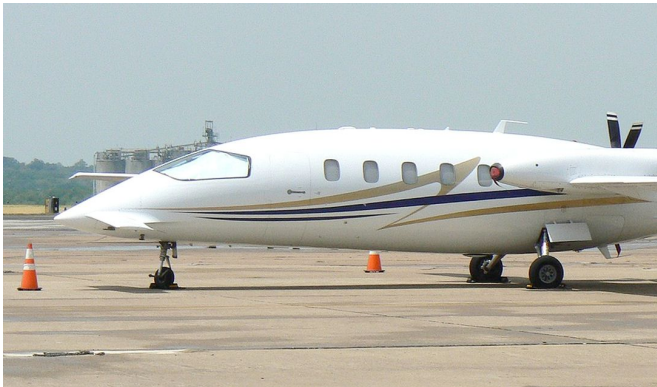
Piaggio Avanti P180 Cockpit Heatshields

Cockpit Heatshields are interior sunshades for the aircraft's cockpit. The product is a unique composite of closed-cell foam with a silver mylar finish. The semi-rigid design is stiff enough to stand inside the window framing. The set folds up flat and is easily stored in the included storage sleeve. Some designs may require velcro and suction cups. A Heatshield is an excellent short-term remedy for cockpit overheating, but an external fabric cover is more effective for long-term protection.