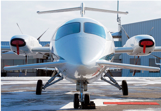
Piaggio 180 Engine Plugs

Engine Inlet Plugs are custom fit for your Piaggio Avanti P180 intakes, made with heavy-duty vinyl material, and stuffed with a single block of sculpted urethane foam. Each plug has a zipper that allows the foam to be removed and dried if necessary. Engine plugs have warning flags that are visible from the cockpit or 'remove before flight' streamers sewn onto the face of the plugs. Most plugs are imprinted with the aircraft registration number in black for an extra charge. Storage bag NOT included. Engine plugs may be inserted after flight when the engine is still warm. Engine Inlet Plugs are commonly referred to as Cowl Plugs, Intake Plugs, Cowl Blocks, Engine Blocks, and Engine Bungs.