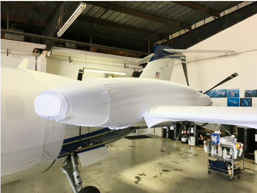
Piaggio P180 Fuselage/Canard Cover & Wing/Engine Covers (test fit covers)