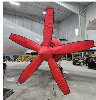
Fairchild Metro 5 Blade Insulated Insulated Prop Covers