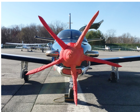
Socata TBM Insulated 5-Blade Prop/Spinner Cover

This cover type is made from Silver Acrylic Sunbrella canvas and is 100% lined with a soft and smooth microfiber. Bruce's Custom Covers developed this material combination especially for aircraft protection. The outer material is medium weight and treated for water resistance, UV resistance and anti-static buildup. The inner lining is a very soft and smooth microfiber to prevent scratching. The material is very reflective, and tests show that the cabin interior temperature can be reduced to near-ambient temperature on the hottest of days. It is water, ice and snow repellent, yet breathable to allow moisture to escape from between the cover and the aircraft surface.