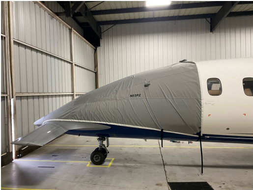
Piaggio 180 Cockpit/Nose Cover, Travel Weight

Travel Covers are made with Silver Solution-Dyed Polyester fabric and only lined over the windshield to save weight. The material is lightweight and more compact for easy stowage in the aircraft. The polyester material is water resistant, but only intended for occasional use outside. We also have an ultra lightweight material available for fitted hangar dust covers. For daily outdoor use, the non-travel Sunbrella Cover is the best choice.