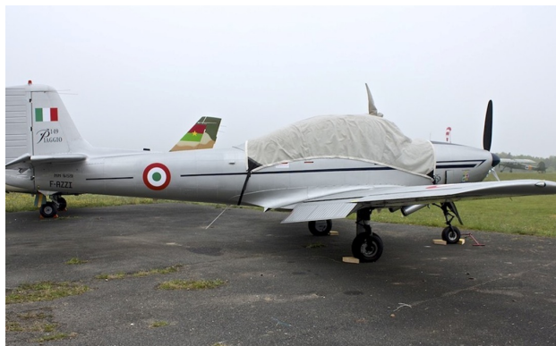
Piaggio P-149 Canopy Cover

Cover and Engine Cover. This cover will enclose the engine cowl and will extend aft to cover all of the windows. This cover type is made from Silver Acrylic Sunbrella canvas and is 100% lined with a soft and smooth microfiber. Bruce's Custom Covers developed this material combination especially for aircraft protection. The outer material is medium weight and treated for water resistance, UV resistance and anti-static buildup. The inner lining is a very soft and smooth microfiber to prevent scratching. The material is very reflective, and tests show that the cabin interior temperature can be reduced to near-ambient temperature on the hottest of days. It is water, ice and snow repellent, yet breathable to allow moisture to escape from between the cover and the aircraft surface.