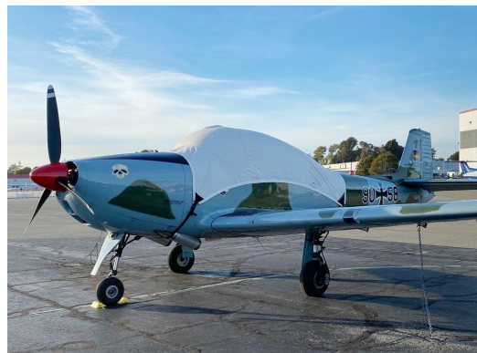
Focke Wulf 149 Trainer Canopy Cover