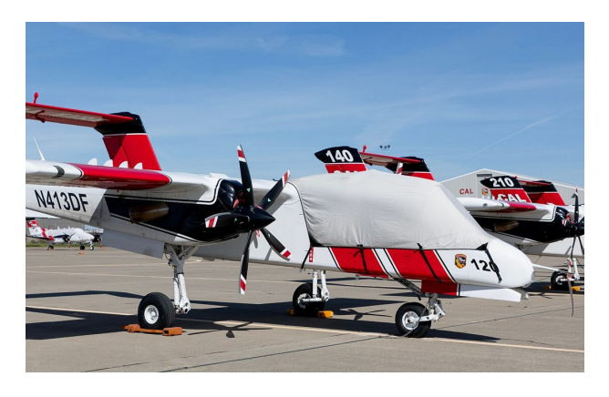
Rockwell OV-10A Bronco Cockpit Cover