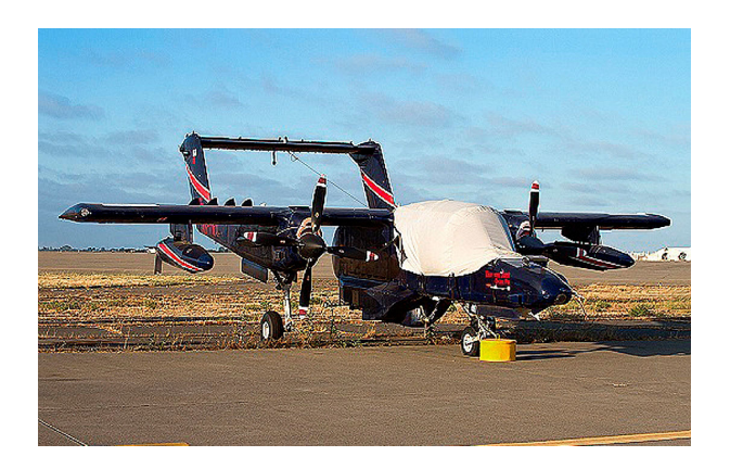
Rockwell OV-10 Canopy Cover