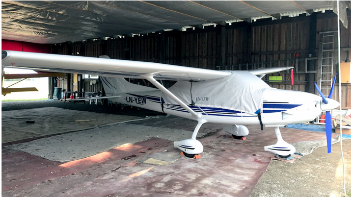
TL Ultralight Sirius TL-3000 Canopy Cover (Over-The-Top Style)

This cover type is made from Silver Acrylic Sunbrella canvas and is 100% lined with a soft and smooth microfiber. Bruce's Custom Covers developed this material combination especially for aircraft protection. The outer material is medium weight and treated for water resistance, UV resistance and anti-static buildup. The inner lining is a very soft and smooth microfiber to prevent scratching. The material is very reflective, and tests show that the cabin interior temperature can be reduced to near-ambient temperature on the hottest of days. It is water, ice and snow repellent, yet breathable to allow moisture to escape from between the cover and the aircraft surface.