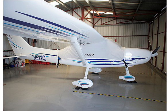
TL Ultralight Sirius Canopy Cover