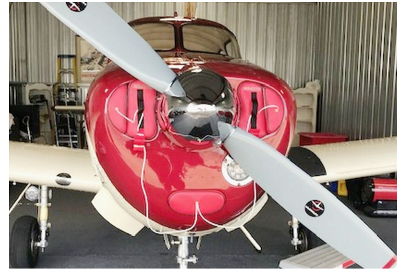
Ryan Navion B Engine Inlet Plugs