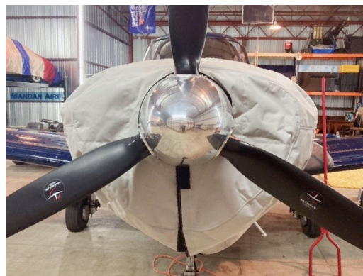
Navion Insulated Engine Cover