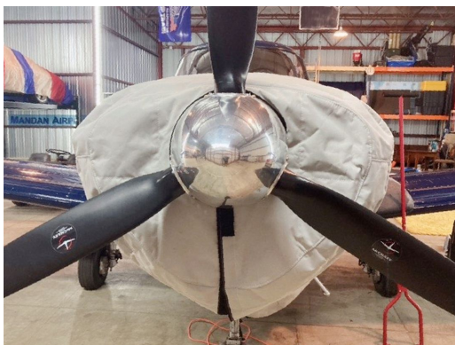
Navion Insulated Engine Cover

This cover type is made from Silver Acrylic Sunbrella canvas and is 100% lined with a soft and smooth microfiber. Bruce's Custom Covers developed this material combination especially for aircraft protection. The outer material is medium weight and treated for water resistance, UV resistance and anti-static buildup. The inner lining is a very soft and smooth microfiber to prevent scratching. The material is very reflective, and tests show that the cabin interior temperature can be reduced to near-ambient temperature on the hottest of days. It is water, ice and snow repellent, yet breathable to allow moisture to escape from between the cover and the aircraft surface.