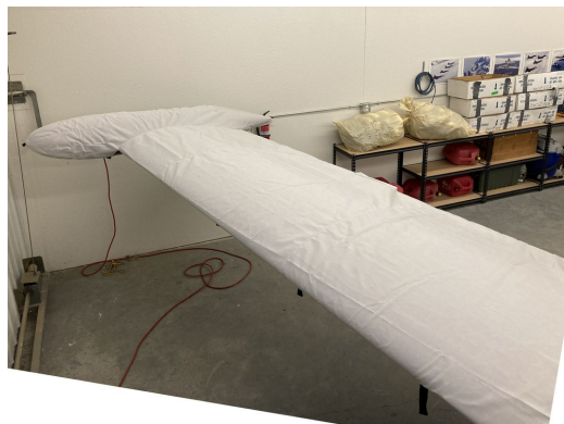
Navion Rangemaster Wing Covers