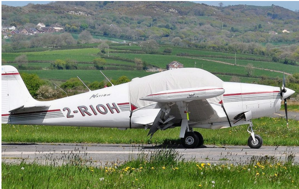
Navion Rangemaster Canopy Cover

This cover type is made from Silver Acrylic Sunbrella canvas and is 100% lined with a soft and smooth microfiber. Bruce's Custom Covers developed this material combination especially for aircraft protection. The outer material is medium weight and treated for water resistance, UV resistance and anti-static buildup. The inner lining is a very soft and smooth microfiber to prevent scratching. The material is very reflective, and tests show that the cabin interior temperature can be reduced to near-ambient temperature on the hottest of days. It is water, ice and snow repellent, yet breathable to allow moisture to escape from between the cover and the aircraft surface.