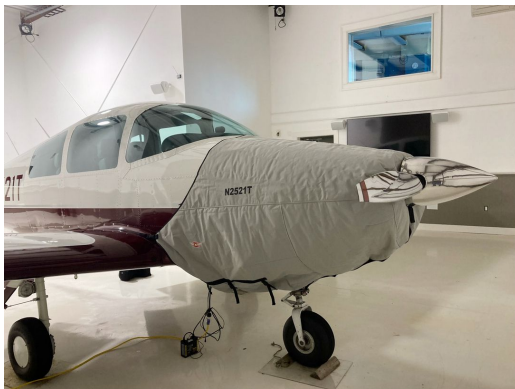
NAVION H Insulated Engine Cover

This cover type is made from Silver Acrylic Sunbrella canvas and is 100% lined with a soft and smooth microfiber. Bruce's Custom Covers developed this material combination especially for aircraft protection. The outer material is medium weight and treated for water resistance, UV resistance and anti-static buildup. The inner lining is a very soft and smooth microfiber to prevent scratching. The material is very reflective, and tests show that the cabin interior temperature can be reduced to near-ambient temperature on the hottest of days. It is water, ice and snow repellent, yet breathable to allow moisture to escape from between the cover and the aircraft surface.