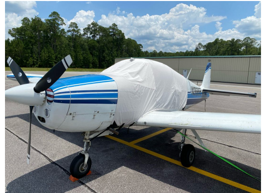
Navion Rangemaster Extended Canopy Cover