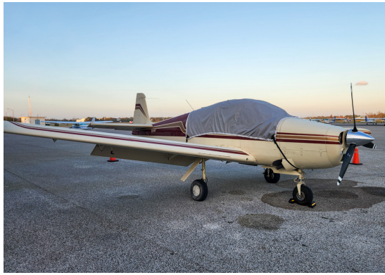
Navion Rangemaster Travel Cover, Light Weight Canopy Cover, (Super Slope windshield)