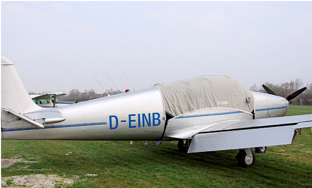
Navion Rangemaster Canopy Cover