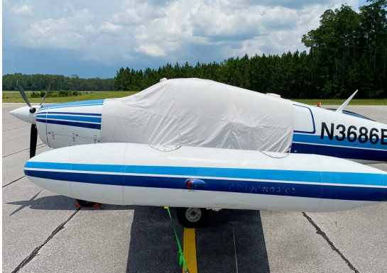
Navion Rangemaster Extended Canopy Cover

This cover type is made from Silver Acrylic Sunbrella canvas and is 100% lined with a soft and smooth microfiber. Bruce's Custom Covers developed this material combination especially for aircraft protection. The outer material is medium weight and treated for water resistance, UV resistance and anti-static buildup. The inner lining is a very soft and smooth microfiber to prevent scratching. The material is very reflective, and tests show that the cabin interior temperature can be reduced to near-ambient temperature on the hottest of days. It is water, ice and snow repellent, yet breathable to allow moisture to escape from between the cover and the aircraft surface.