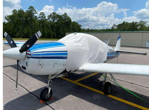
Navion Rangemaster Extended Canopy Cover