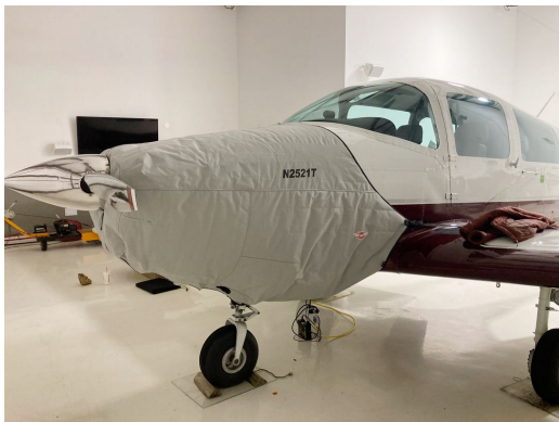
NAVION H Insulated Engine Cover