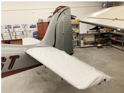
Navion Rangemaster Horizontal Stabilizer Covers

mitigation, or for occasional travel. The material is lighter and more compact, but more susceptible to UV damage and may have a shorter useful life if used continuously outside than the all-year use material.