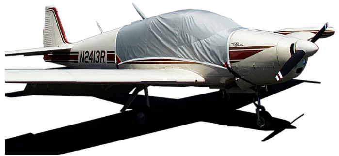
Covers & Plugs for the Navion Rangemaster