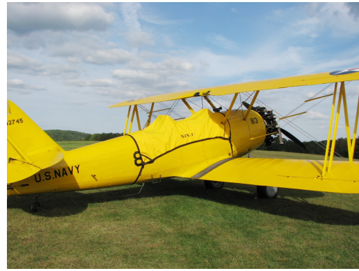
N3N Canopy Cover