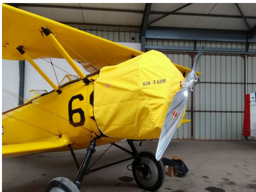
N3N Engine Cover

This cover type is made from Silver Acrylic Sunbrella canvas and is 100% lined with a soft and smooth microfiber. Bruce's Custom Covers developed this material combination especially for aircraft protection. The outer material is medium weight and treated for water resistance, UV resistance and anti-static buildup. The inner lining is a very soft and smooth microfiber to prevent scratching. The material is very reflective, and tests show that the cabin interior temperature can be reduced to near-ambient temperature on the hottest of days. It is water, ice and snow repellent, yet breathable to allow moisture to escape from between the cover and the aircraft surface.