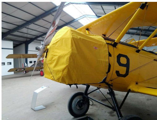
N3N Engine Cover

This cover type is made from Silver Acrylic Sunbrella canvas and is 100% lined with a soft and smooth microfiber. Bruce's Custom Covers developed this material combination especially for aircraft protection. The outer material is medium weight and treated for water resistance, UV resistance and anti-static buildup. The inner lining is a very soft and smooth microfiber to prevent scratching. The material is very reflective, and tests show that the cabin interior temperature can be reduced to near-ambient temperature on the hottest of days. It is water, ice and snow repellent, yet breathable to allow moisture to escape from between the cover and the aircraft surface.