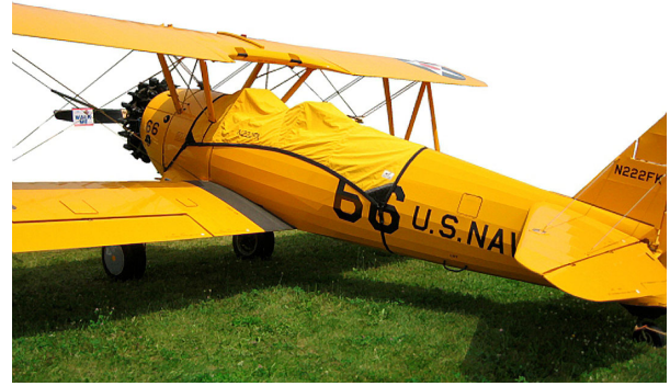
Stearman Canopy Cover