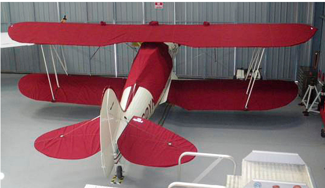
Waco UPF-7 Upper/Lower Wing Cover, Horizontal Stabilizer Cover, & Canopy Cover

WINTER USE MATERIAL - Made with Solution-Dyed Polyester fabric, this option is intended for seasonal use to aid in deicing, rain mitigation, or for occasional travel. The material is lighter and more compact, but more susceptible to UV damage and may have a shorter useful life if used continuously outside than the all-year use material.