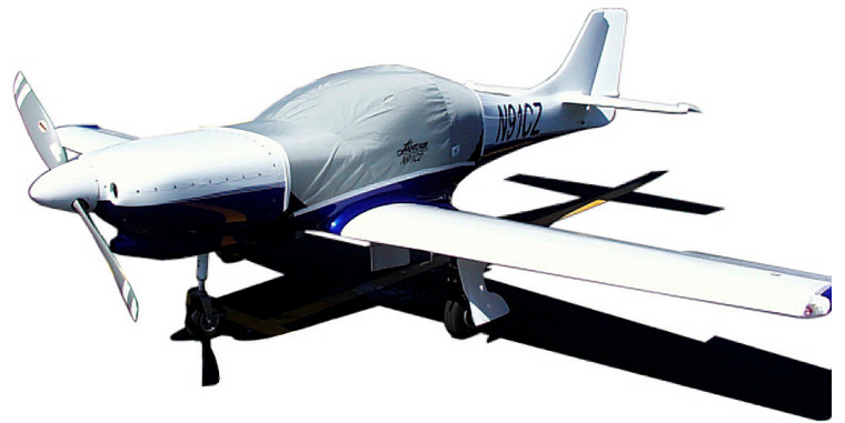
Canopy Cover for Lancair 320/360