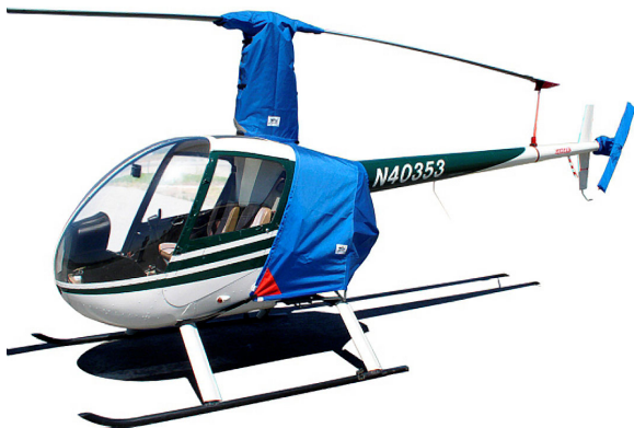
Robinson R-22 Engine, Rotor Mast & Tail Rotor Covers, with Blade Tie-down

Bruce's Autogyro MTO Sport, 2010, 2017 Gyrocopter Blade Covers are made of medium-weight Solution-Dyed Polyester and designed to avoid trim tabs or wicks. You can install Blade Covers from the ground with the aid of a lightweight rope attached to the open end. Covers are cinched tight at the blade root with straps and quick-release plastic buckles. The Cold Weather Blade Covers are fitted with full-length zippers and optional deice "boots" designed to accept a preheater hose; a small opening at the tip of the cover allows for some air circulation and drainage in freezing weather. Some part numbers have features for an extra charge.