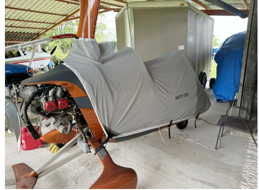
MTO Sport Travel Weight Canopy/Nose Cover