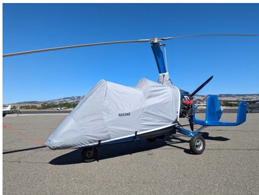
Autogyro MTOSPORT Travel Cover, Light Weight Canopy/Nose Cover

Travel Covers are made with Silver Solution-Dyed Polyester fabric and fully lined over the entire cover. The material is lightweight and more compact for easy stowage in the aircraft. The polyester material is water resistant, but only intended for occasional use outside. We also have an ultra lightweight material available for fitted hangar dust covers. For daily outdoor use, the non-travel Sunbrella Cover is the best choice.