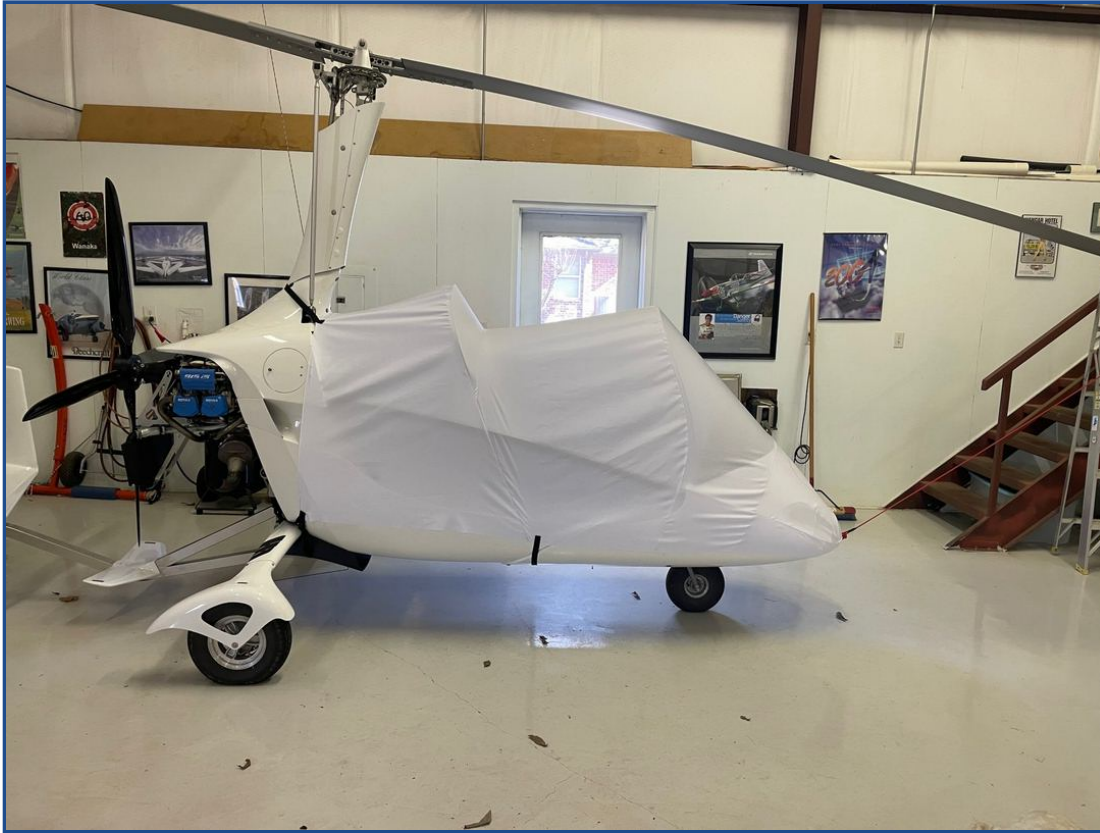
MTO Sport Gyrocopter Canopy/Nose Cover, test fit cover