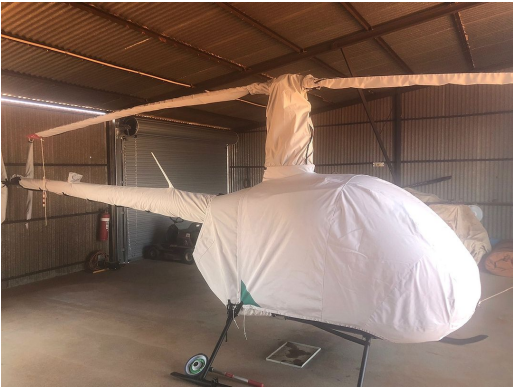
Robinson R-22 Full Cover Set