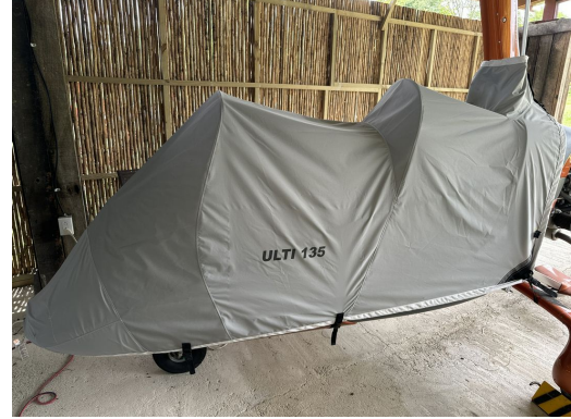
MTO Sport Travel Weight Canopy/Nose Cover