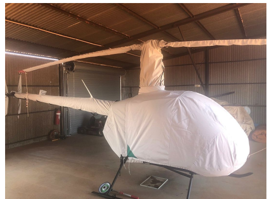
Robinson R-22 Full Cover Set