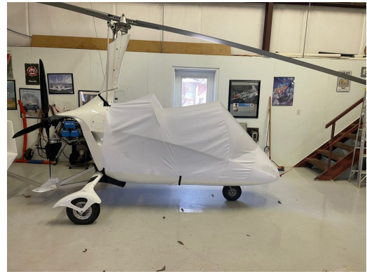
MTO Sport Gyrocopter Canopy/Nose Cover, test fit cover