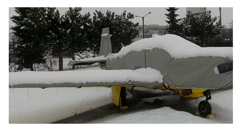
Mooney 231 Full Cover Set, doing its job in the Austrian Winter