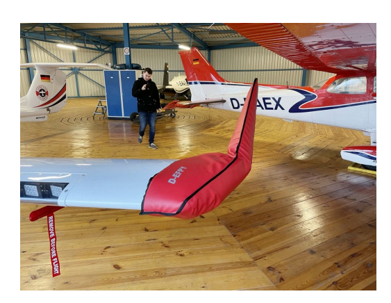
Diamond DA-40 Wingtip Pads

Designed to prevent damage to the aircraft extremities in crowded hangars, these products are made of bright red Naugahyde and thickly padded with a sandwich of closed cell foam.