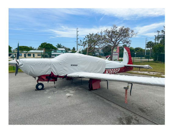
Mooney M20M Extended Canopy, Engine & Wing Covers