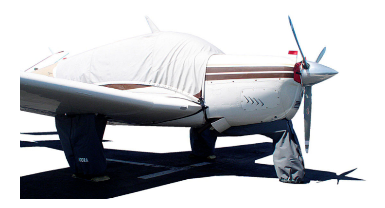
Beech Bonanza/Debonair/Baron Landing Gear Covers