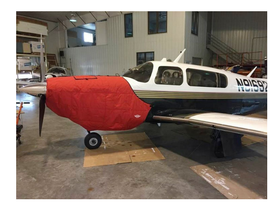
Mooney Ovation Insulated Engine Cover

This cover type is made from Silver Acrylic Sunbrella canvas and is 100% lined with a soft and smooth microfiber. Bruce's Custom Covers developed this material combination especially for aircraft protection. The outer material is medium weight and treated for water resistance, UV resistance and anti-static buildup. The inner lining is a very soft and smooth microfiber to prevent scratching. The material is very reflective, and tests show that the cabin interior temperature can be reduced to near-ambient temperature on the hottest of days. It is water, ice and snow repellent, yet breathable to allow moisture to escape from between the cover and the aircraft surface.