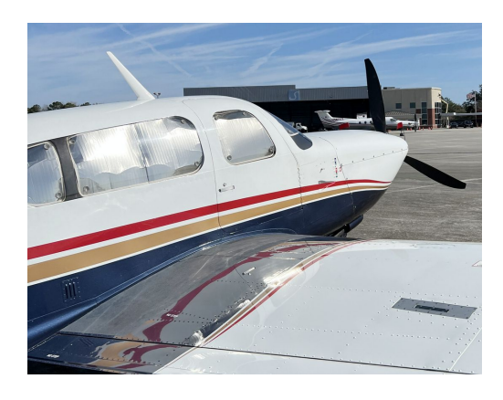
Mooney M20S Heatshield Set