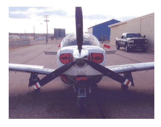
Mooney M20M TLS Engine Plugs

Engine Inlet Plugs are custom fit for your Mooney TLS, Bravo, Acclaim TN, Type S, & Porsche Powered Models intakes, made with heavy-duty vinyl material, and stuffed with a single block of sculpted urethane foam. Each plug has a zipper that allows the foam to be removed and dried if necessary. Engine plugs have warning flags that are visible from the cockpit or 'remove before flight' streamers sewn onto the face of the plugs. Most plugs are imprinted with the aircraft registration number in black for an extra charge. Storage bag NOT included. Engine plugs may be inserted after flight when the engine is still warm. Engine Inlet Plugs are commonly referred to as Cowl Plugs, Intake Plugs, Cowl Blocks, Engine Blocks, and Engine Bungs.