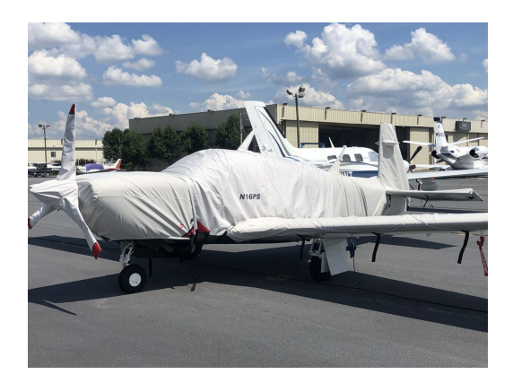
Mooney M20TN Acclaim Full Cover Set

This cover type is made from Silver Acrylic Sunbrella canvas and is 100% lined with a soft and smooth microfiber. Bruce's Custom Covers developed this material combination especially for aircraft protection. The outer material is medium weight and treated for water resistance, UV resistance and anti-static buildup. The inner lining is a very soft and smooth microfiber to prevent scratching. The material is very reflective, and tests show that the cabin interior temperature can be reduced to near-ambient temperature on the hottest of days. It is water, ice and snow repellent, yet breathable to allow moisture to escape from between the cover and the aircraft surface.