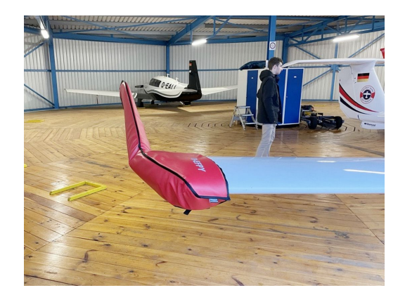
Diamond DA-40 Wingtip Pads