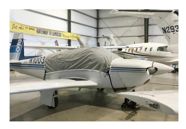
Mooney 201 Travel Cover, Light Weight Travel Canopy Cover, 5 Lbs