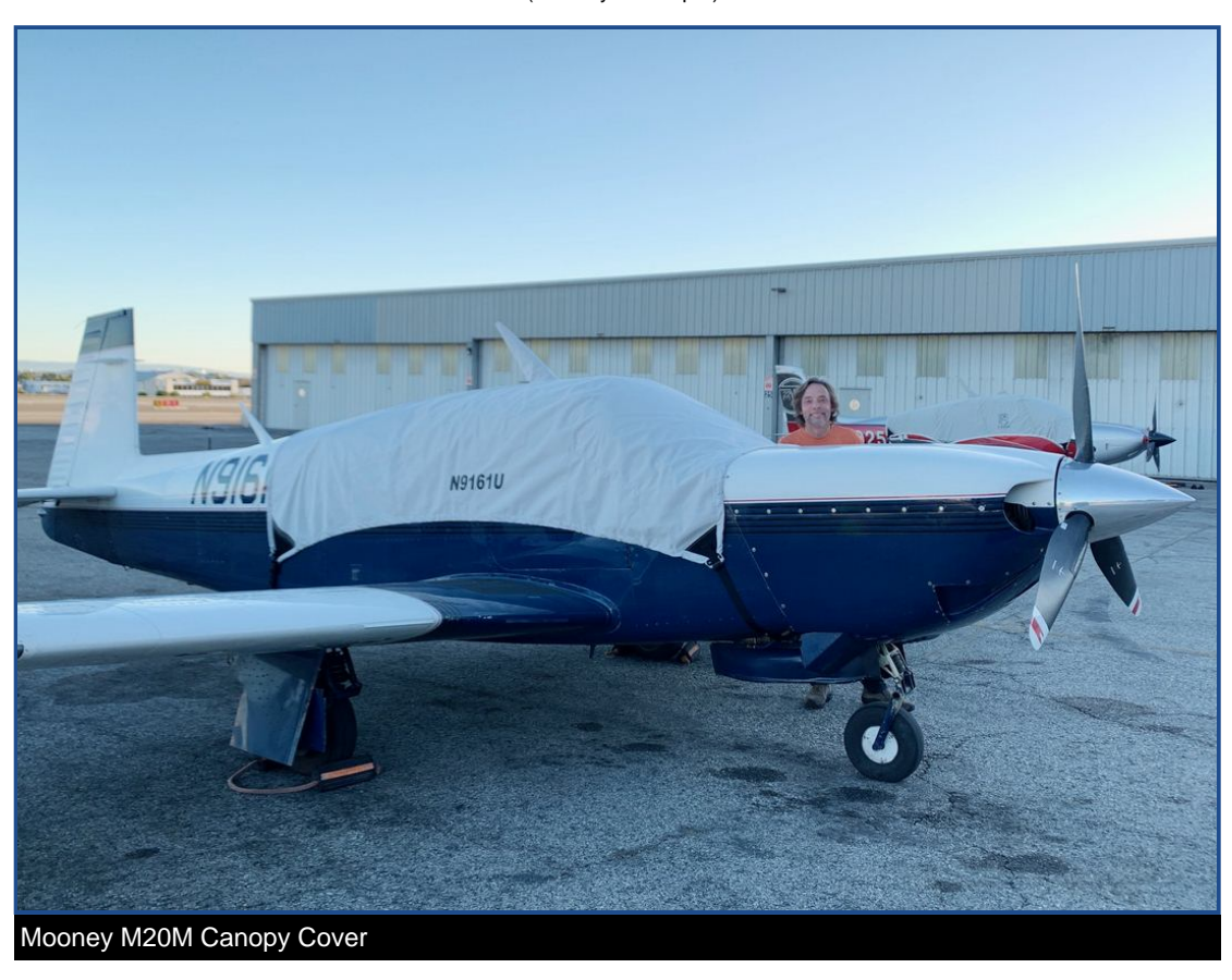
Section 1: Canopy/Cockpit/Fuselage Covers

Canopy Covers help reduce damage to your airplane's upholstery and avionics caused by excessive heat, and they can eliminate problems caused by leaking door and window seals. They keep the windshield and window surfaces clean and help prevent vandalism and theft.