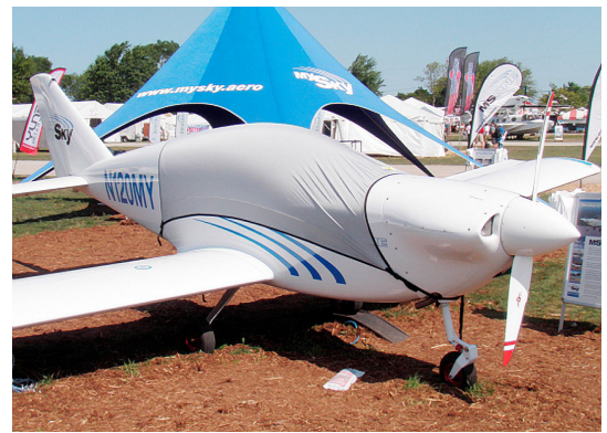
Mysky Fly-Away Travel Cover