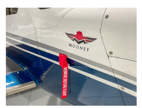
Mooney NACA Plug

Engine Inlet Plugs are custom fit for your Mooney Ovation & Ovation Ultra intakes, made with heavy-duty vinyl material, and stuffed with a single block of sculpted urethane foam. Each plug has a zipper that allows the foam to be removed and dried if necessary. Engine plugs have warning flags that are visible from the cockpit or 'remove before flight' streamers sewn onto the face of the plugs. Most plugs are imprinted with the aircraft registration number in black for an extra charge. Storage bag NOT included. Engine plugs may be inserted after flight when the engine is still warm. Engine Inlet Plugs are commonly referred to as Cowl Plugs, Intake Plugs, Cowl Blocks, Engine Blocks, and Engine Bungs.