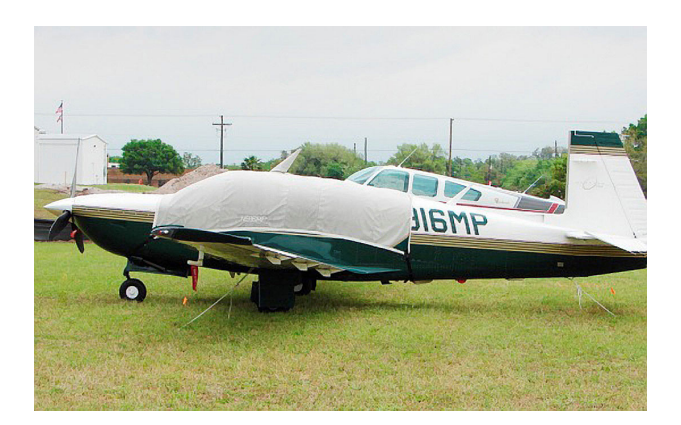
Mooney Ovation Canopy Cover