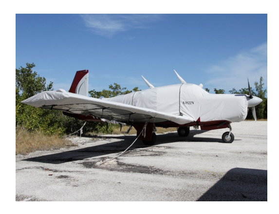
Mooney M20C Extended Canopy/Engine & Wing Covers