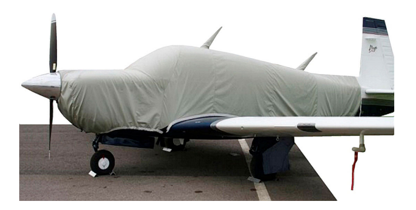
Mooney M20 Extra Extended Canopy/Engine Cover

This cover type is made from Silver Acrylic Sunbrella canvas and is 100% lined with a soft and smooth microfiber. Bruce's Custom Covers developed this material combination especially for aircraft protection. The outer material is medium weight and treated for water resistance, UV resistance and anti-static buildup. The inner lining is a very soft and smooth microfiber to prevent scratching. The material is very reflective, and tests show that the cabin interior temperature can be reduced to near-ambient temperature on the hottest of days. It is water, ice and snow repellent, yet breathable to allow moisture to escape from between the cover and the aircraft surface.