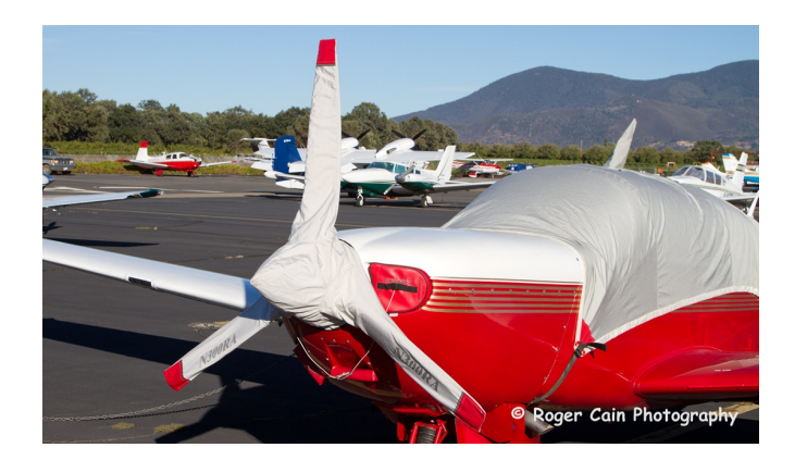
Mooney M20M Bravo 3-Blade Prop Cover, Engine Plugs

This cover type is made from Silver Acrylic Sunbrella canvas and is 100% lined with a soft and smooth microfiber. Bruce's Custom Covers developed this material combination especially for aircraft protection. The outer material is medium weight and treated for water resistance, UV resistance and anti-static buildup. The inner lining is a very soft and smooth microfiber to prevent scratching. The material is very reflective, and tests show that the cabin interior temperature can be reduced to near-ambient temperature on the hottest of days. It is water, ice and snow repellent, yet breathable to allow moisture to escape from between the cover and the aircraft surface.