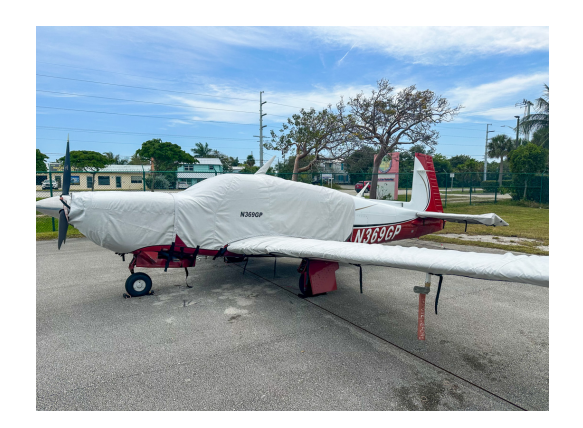
Mooney M20M Extended Canopy, Engine & Wing Covers