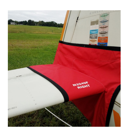
Mooney M20E Tailcone Cover