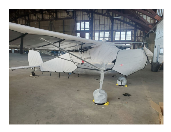
Cessna 140 Canopy, Wings, Prop, Tires & Empennage Covers