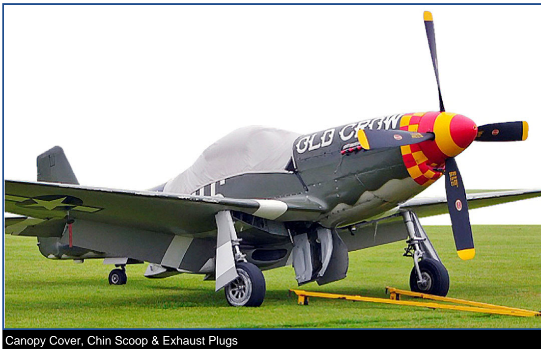
Canopy Cover, Chin Scoop &amp; Exhaust Plugs