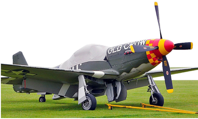
Canopy Cover, Chin Scoop & Exhaust Plugs