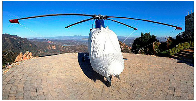
Agusta 109 Mk II+ Bubble Cover and Blade Tie-downs