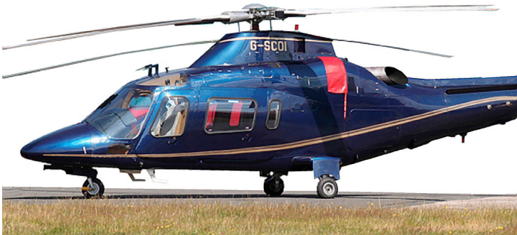
Agusta Power Intake Cover