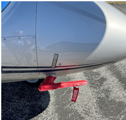
Agusta AW109 (A, C, & Trekker) Pitot Cover Set

The Engine Inlet Plugs are custom fit for your Agusta MH-68A, Sting Ray intakes, made with heavy-duty vinyl material, and stuffed with a single block of sculpted urethane foam. Each plug has a zipper that allows the foam to be removed and dried if necessary. Engine plugs have 'Remove Before Flight' streamers sewn onto the face of the plugs. Most plugs are imprinted with the aircraft registration number in black for an extra charge. Storage bag NOT included. Engine plugs may be inserted after flight when the engine is still warm. Engine Inlet Plugs are commonly referred to as Cowl Plugs, Intake Plugs, Cowl Blocks, Engine Blocks, and Engine Bung.