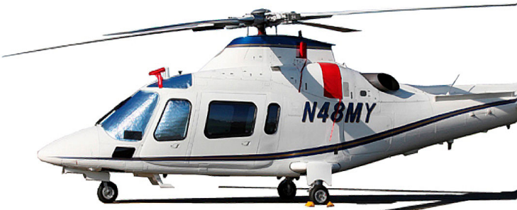
Agusta Power Pitot Covers, Intake Covers, and Cockpit Heatshield set

WINTER USE MATERIAL - Made with Solution-Dyed Polyester fabric, this option is intended for seasonal use to aid in deicing, rain mitigation, or for occasional travel. The material is lighter and more compact, but more susceptible to UV damage and may have a shorter useful life if used continuously outside than the all-year use material.