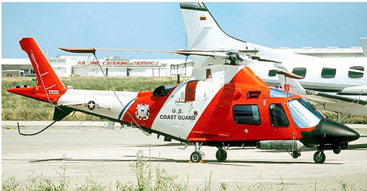
Covers, Plugs, HeatShields and related items for the Agusta MH-68A

Heatshields are interior sunshades for an aircraft's windows or canopy glass. The product is a unique composite of closed-cell foam with a silver mylar finish. The semi-rigid design is stiff enough to stand along the inside of the windshield using sun visors or window framing. It folds up flat and easily stores in the included storage sleeve. Some designs may require velcro and suction cups. A Heatshield is an excellent short-term remedy for cockpit overheating.