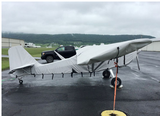
Kitfox 5 Complete Cover Set

This cover type is made from Silver Acrylic Sunbrella canvas and is 100% lined with a soft and smooth microfiber. Bruce's Custom Covers developed this material combination especially for aircraft protection. The outer material is medium weight and treated for water resistance, UV resistance and anti-static buildup. The inner lining is a very soft and smooth microfiber to prevent scratching. The material is very reflective, and tests show that the cabin interior temperature can be reduced to near-ambient temperature on the hottest of days. It is water, ice and snow repellent, yet breathable to allow moisture to escape from between the cover and the aircraft surface.