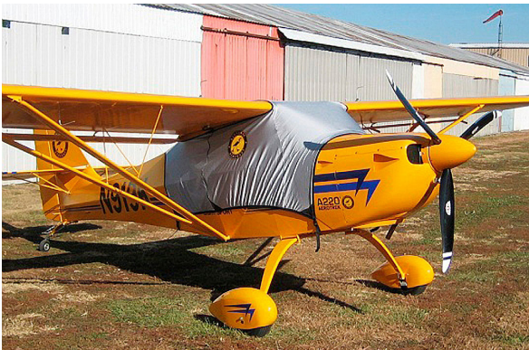
Aerotrek A220 Fitted Hangar Dust Cover

Travel Covers are made with Silver Solution-Dyed Polyester fabric and only lined over the windshield to save weight. The material is lightweight and more compact for easy stowage in the aircraft. The polyester material is water resistant, but only intended for occasional use outside. We also have an ultra lightweight material available for fitted hangar dust covers. For daily outdoor use, the non-travel Sunbrella Cover is the best choice.