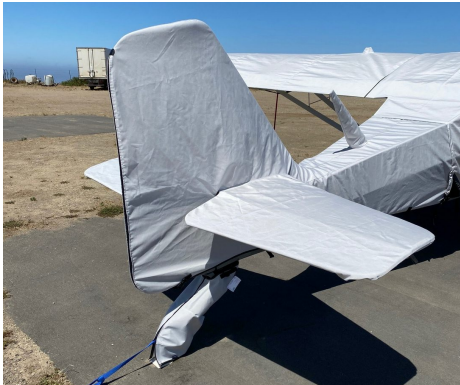
Kitfox Full Cover Set

ALL-YEAR USE MATERIAL - Made with Silver Acrylic Sunbrella canvas, the all-year use material is the best option for sun protection and cover longevity. This heavier more durable material is intended for all weather conditions, such as rain and snow or lots of sun.