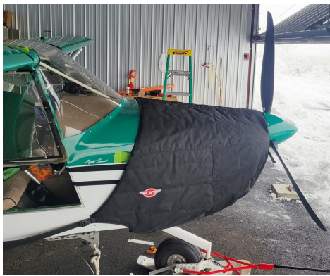
Kitfox Insulated Engine Cover