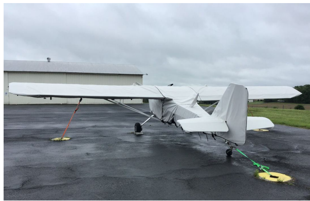
Kitfox 5 Complete Cover Set