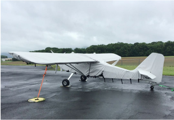
Kitfox 5 Complete Cover Set