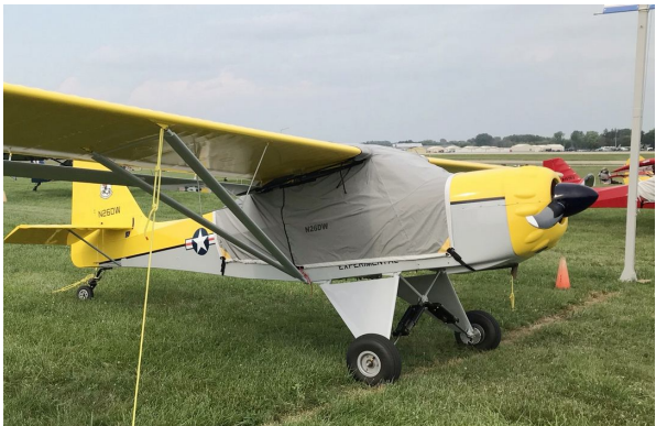
Kitfox Travel Canopy Cover