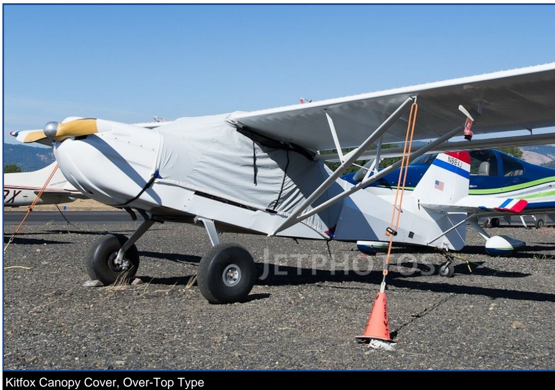
Kitfox Canopy Cover, Over-Top Type