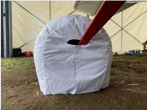
Cub Crafters CC19 Oversize Tire Covers, test fit cover