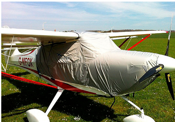
EuroFox and Aerotrek A240 Lightweight Travel Canopy/Engine Cover

This cover type is made from Silver Acrylic Sunbrella canvas and is 100% lined with a soft and smooth microfiber. Bruce's Custom Covers developed this material combination especially for aircraft protection. The outer material is medium weight and treated for water resistance, UV resistance and anti-static buildup. The inner lining is a very soft and smooth microfiber to prevent scratching. The material is very reflective, and tests show that the cabin interior temperature can be reduced to near-ambient temperature on the hottest of days. It is water, ice and snow repellent, yet breathable to allow moisture to escape from between the cover and the aircraft surface.