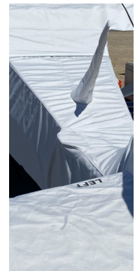
Kitfox Full Cover Set