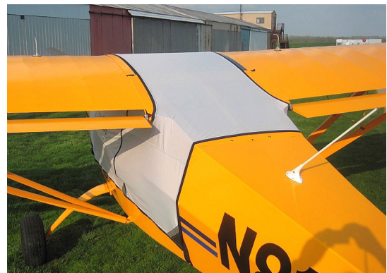
Aerotrek A240 Spandex FlyAway Travel Canopy Cover