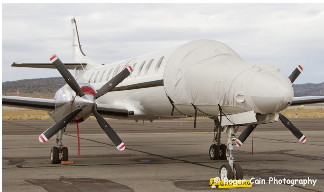
Merlin Cockpit/Nose Cover

This cover type is made from Silver Acrylic Sunbrella canvas and is 100% lined with a soft and smooth microfiber. Bruce's Custom Covers developed this material combination especially for aircraft protection. The outer material is medium weight and treated for water resistance, UV resistance and anti-static buildup. The inner lining is a very soft and smooth microfiber to prevent scratching. The material is very reflective, and tests show that the cabin interior temperature can be reduced to near-ambient temperature on the hottest of days. It is water, ice and snow repellent, yet breathable to allow moisture to escape from between the cover and the aircraft surface.