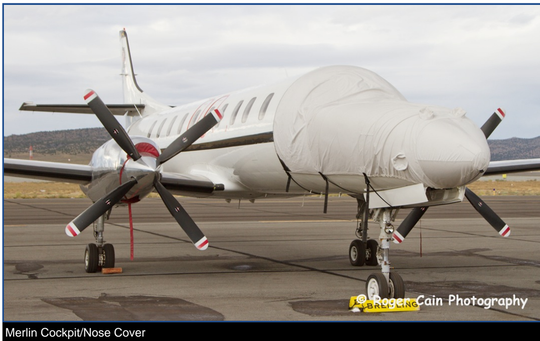
Merlin Cockpit/Nose Cover