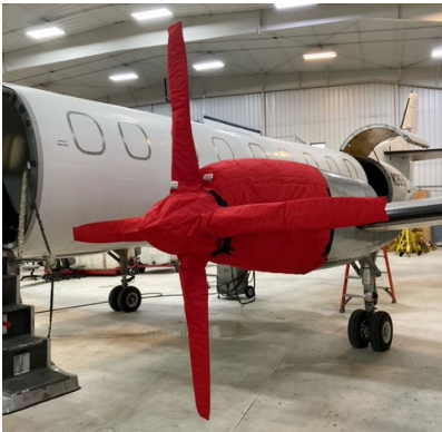
Fairchild Merlin Insulated Engine & Prop Covers