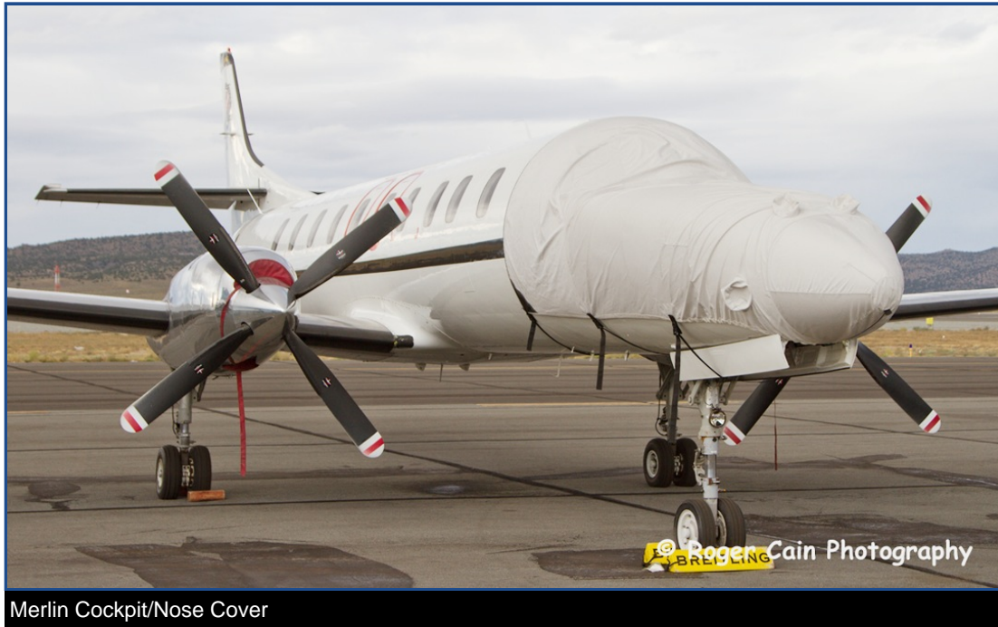
Merlin Cockpit/Nose Cover