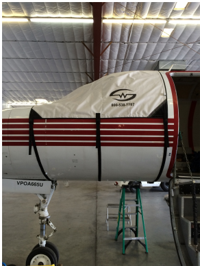
Merlin Cockpit Cover