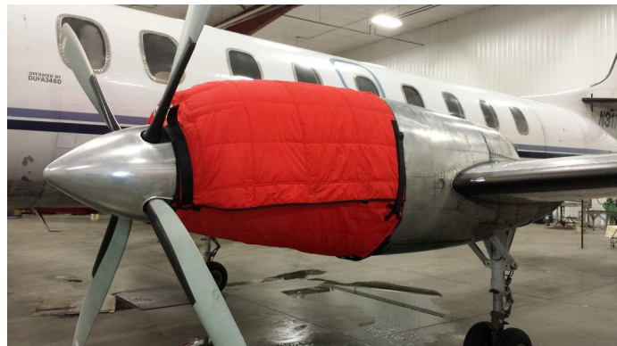
Merlin Insulated Engine Covers