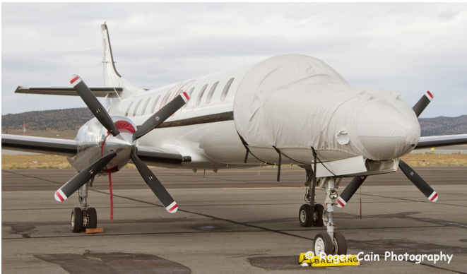
Merlin Cockpit/Nose Cover

This cover type is made from Silver Acrylic Sunbrella canvas and is 100% lined with a soft and smooth microfiber. Bruce's Custom Covers developed this material combination especially for aircraft protection. The outer material is medium weight and treated for water resistance, UV resistance and anti-static buildup. The inner lining is a very soft and smooth microfiber to prevent scratching. The material is very reflective, and tests show that the cabin interior temperature can be reduced to near-ambient temperature on the hottest of days. It is water, ice and snow repellent, yet breathable to allow moisture to escape from between the cover and the aircraft surface.