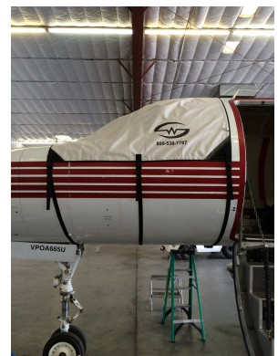
Merlin Cockpit Cover