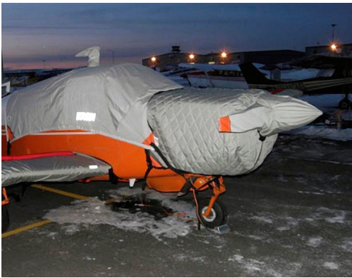
Mooney M20F Prop/Spinner, Insulated Engine, Wing and Canopy Covers

This cover type is made from Silver Acrylic Sunbrella canvas and is 100% lined with a soft and smooth microfiber. Bruce's Custom Covers developed this material combination especially for aircraft protection. The outer material is medium weight and treated for water resistance, UV resistance and anti-static buildup. The inner lining is a very soft and smooth microfiber to prevent scratching. The material is very reflective, and tests show that the cabin interior temperature can be reduced to near-ambient temperature on the hottest of days. It is water, ice and snow repellent, yet breathable to allow moisture to escape from between the cover and the aircraft surface.