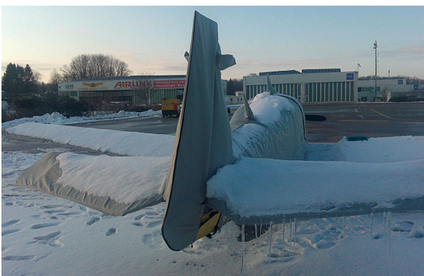
Mooney 231 Full Cover Set...Brrrrrrrr