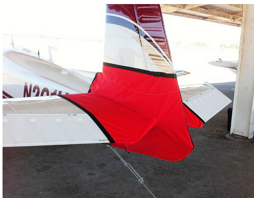
Mooney Tailcone Cover, completely enclosed

WINTER USE MATERIAL - Made with Solution-Dyed Polyester fabric, this option is intended for seasonal use to aid in deicing, rain mitigation, or for occasional travel. The material is lighter and more compact, but more susceptible to UV damage and may have a shorter useful life if used continuously outside than the all-year use material.