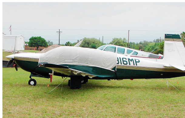
Mooney Ovation Canopy Cover