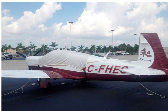
Mooney TLS Canopy Cover

Travel Covers are made with Silver Solution-Dyed Polyester fabric and only lined over the windshield to save weight. The material is lightweight and more compact for easy stowage in the aircraft. The polyester material is water resistant, but only intended for occasional use outside. We also have an ultra lightweight material available for fitted hangar dust covers. For daily outdoor use, the non-travel Sunbrella Cover is the best choice.