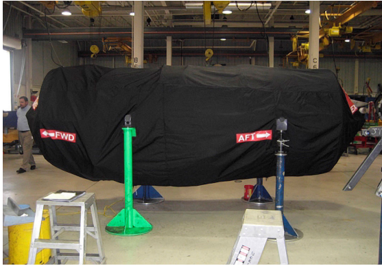
PW JT8D Off-Link Engine Transport Cover (no nose cone, no TR's), fully enclosed

material, and stuffed with a single block of sculpted urethane foam. Each plug has a zipper that allows the foam to be removed and dried if necessary. Engine plugs have 'remove before flight' streamers sewn onto the face of the plugs. Most plugs are imprinted with the aircraft registration number in black for an extra charge. Storage bag NOT included. Engine plugs may be inserted after flight when the engine is still warm. Engine Inlet Plugs are commonly referred to as Cowl Plugs, Intake Plugs, Cowl Blocks, Engine Blocks, and Engine Bungs.