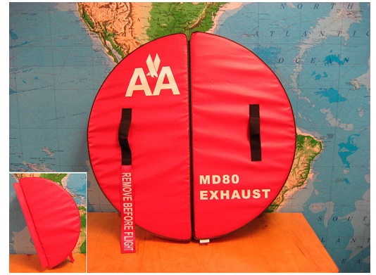
MD-80 Exhaust Plug, folding type