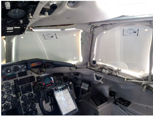
McDonnell Douglas MD80 Cockpit Heatshield Set