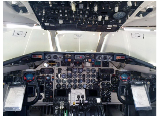
McDonnell Douglas MD80 Cockpit Heatshield Set