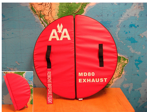
MD-80 Exhaust Plug, folding type

material, and stuffed with a single block of sculpted urethane foam. Each plug has a zipper that allows the foam to be removed and dried if necessary. Engine plugs have 'remove before flight' streamers sewn onto the face of the plugs. Most plugs are imprinted with the aircraft registration number in black for an extra charge. Storage bag NOT included. Engine plugs may be inserted after flight when the engine is still warm. Engine Inlet Plugs are commonly referred to as Cowl Plugs, Intake Plugs, Cowl Blocks, Engine Blocks, and Engine Bungs.