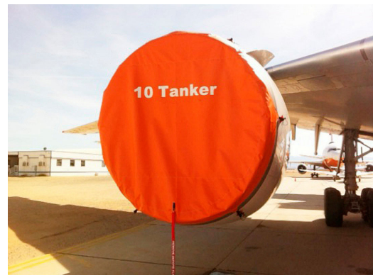
DC-10 Intake Cover