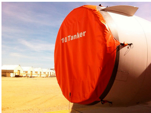
DC-10-30 Intake Cover (CF650C2 Engine)