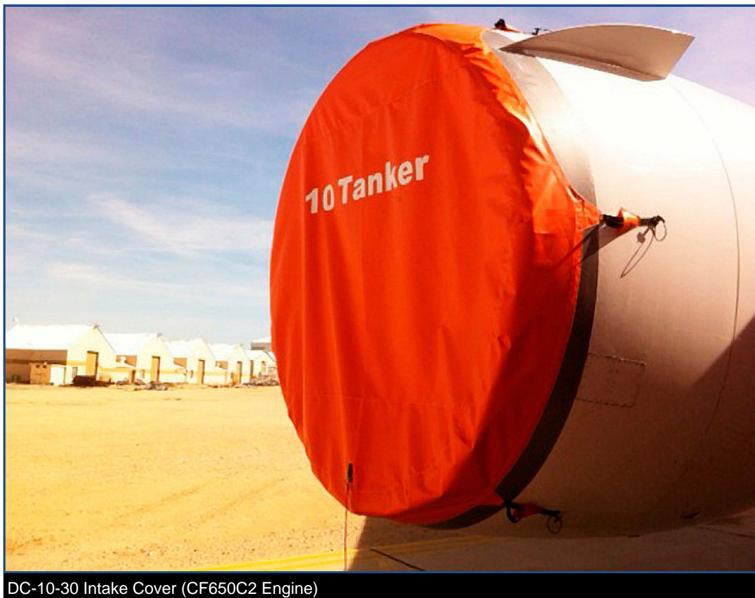
DC-10-30 Intake Cover (CF650C2 Engine)