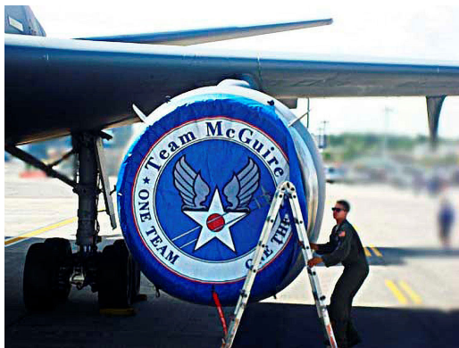
McDonnell Douglas KC-10 Intake Cover