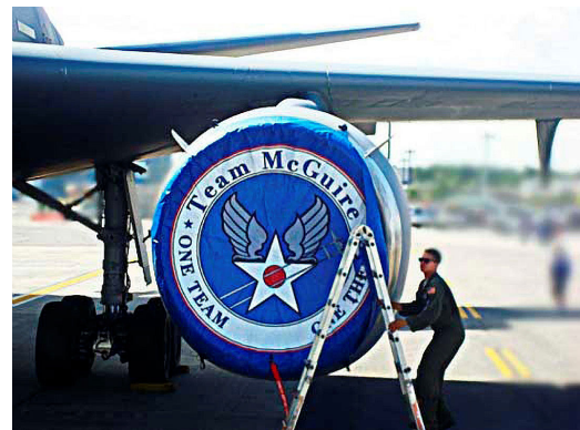
McDonnell Douglas KC-10 Intake Cover