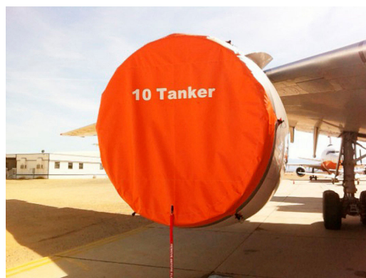
DC-10 Intake Cover