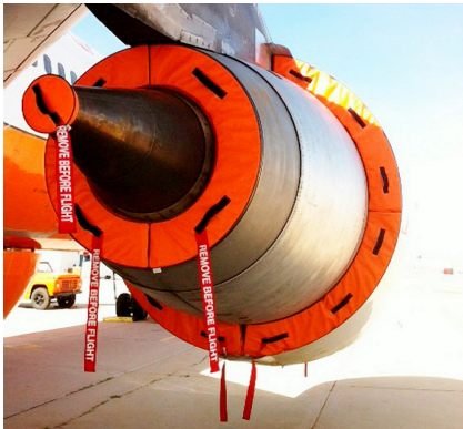
Exhaust Plugs Ship Set, incl. Fan Thrust Reverser and Exhaust Plugs P/N: B767-200 DC-10 Bypass Vent, Exhaust Plug set