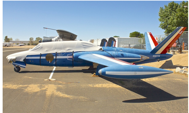
Fouga Magister Canopy/Nose Cover