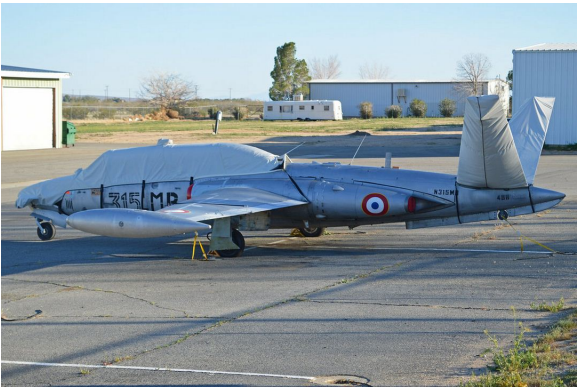
Fouga Magister Canopy/Nose Cover, Tail Stabilizer Covers

WINTER USE MATERIAL - Made with Solution-Dyed Polyester fabric, this option is intended for seasonal use to aid in deicing, rain mitigation, or for occasional travel. The material is lighter and more compact, but more susceptible to UV damage and may have a shorter useful life if used continuously outside than the all-year use material.