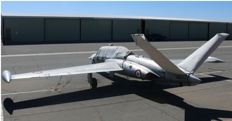
Fougua Magister Canopy/Nose Cover, Tail Stabilizer Covers

This cover type is made from Silver Acrylic Sunbrella canvas and is 100% lined with a soft and smooth microfiber. Bruce's Custom Covers developed this material combination especially for aircraft protection. The outer material is medium weight and treated for water resistance, UV resistance and anti-static buildup. The inner lining is a very soft and smooth microfiber to prevent scratching. The material is very reflective, and tests show that the cabin interior temperature can be reduced to near-ambient temperature on the hottest of days. It is water, ice and snow repellent, yet breathable to allow moisture to escape from between the cover and the aircraft surface.