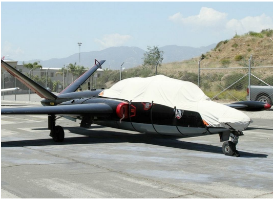
Fouga Magister Canopy/Nose Cover with nose mount loop antenna