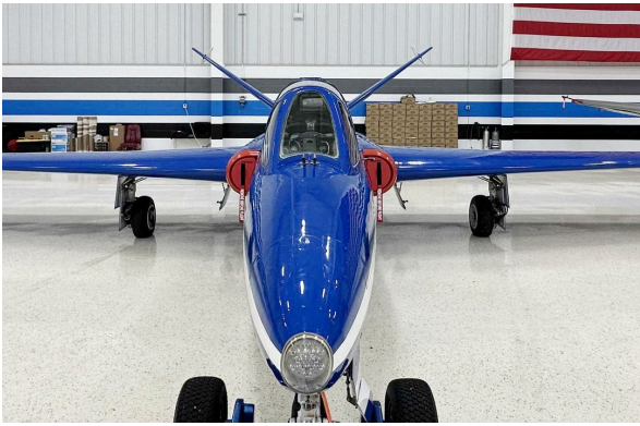
Fouga Magister CM170 Intake Plugs