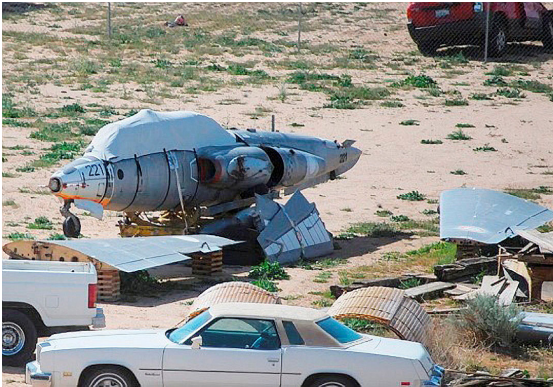
Fouga Magister Canopy Cover

Travel Covers are made with Silver Solution-Dyed Polyester fabric and only lined over the windshield to save weight. The material is lightweight and more compact for easy stowage in the aircraft. The polyester material is water resistant, but only intended for occasional use outside. We also have an ultra lightweight material available for fitted hangar dust covers. For daily outdoor use, the non-travel Sunbrella Cover is the best choice.