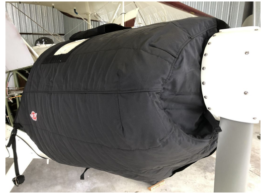
Marquardt Charger MA-5 Insulated Engine Cover