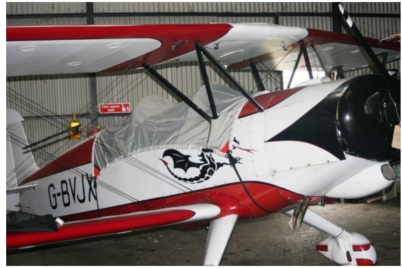
Marquardt Charger MA-5 Canopy Cover