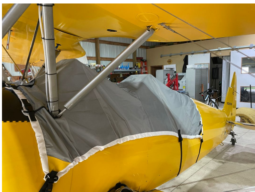
Marquardt Charger Travel Weight Canopy Cover

This cover type is made from Silver Acrylic Sunbrella canvas and is 100% lined with a soft and smooth microfiber. Bruce's Custom Covers developed this material combination especially for aircraft protection. The outer material is medium weight and treated for water resistance, UV resistance and anti-static buildup. The inner lining is a very soft and smooth microfiber to prevent scratching. The material is very reflective, and tests show that the cabin interior temperature can be reduced to near-ambient temperature on the hottest of days. It is water, ice and snow repellent, yet breathable to allow moisture to escape from between the cover and the aircraft surface.