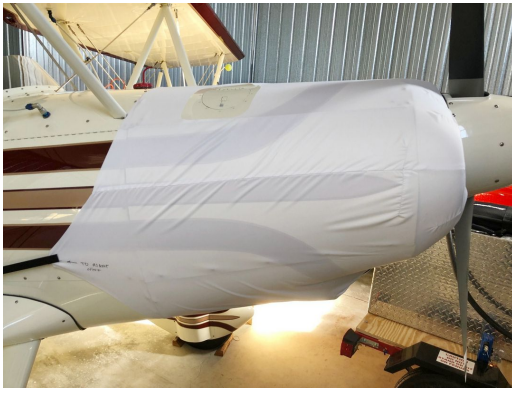
Marquardt Charger Insulated Engine Cover (test fit cover_