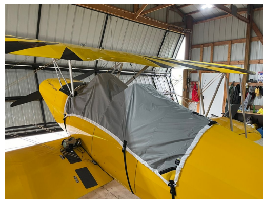
Marquardt Charger Travel Weight Canopy Cover