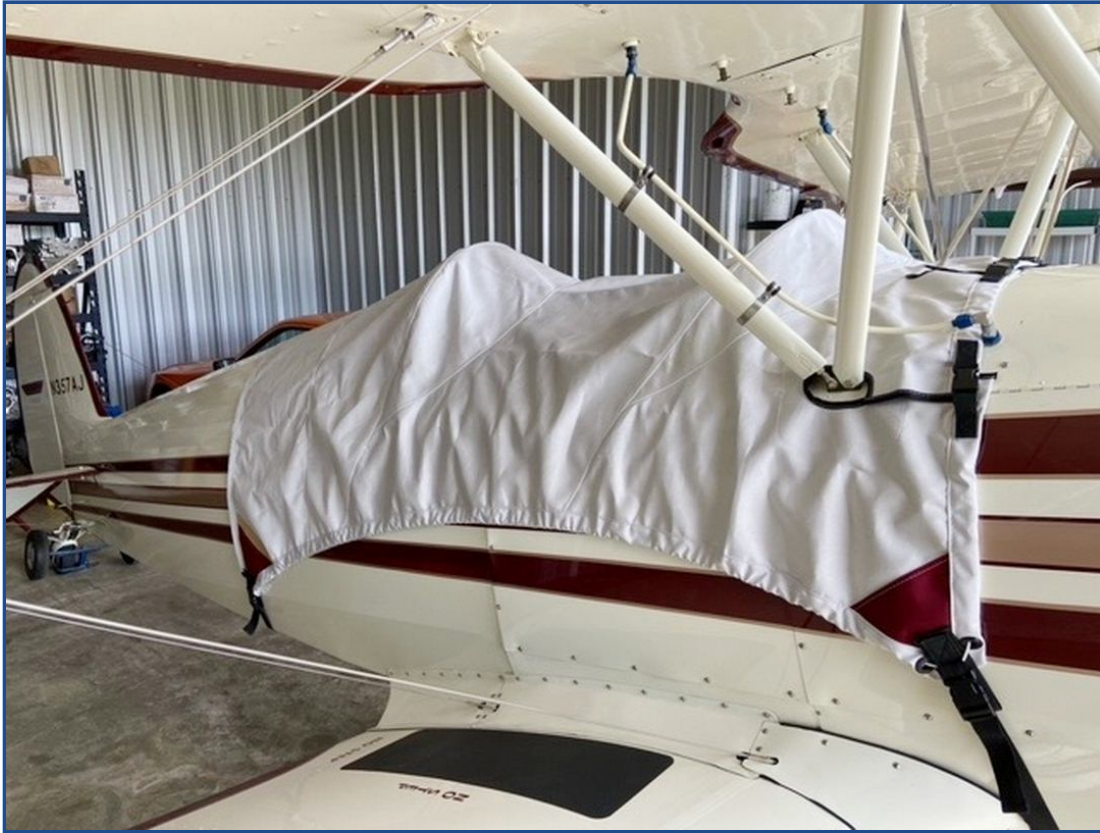
Marquardt Charger Cockpit Cover