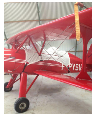
Starduster Too Canopy Cover