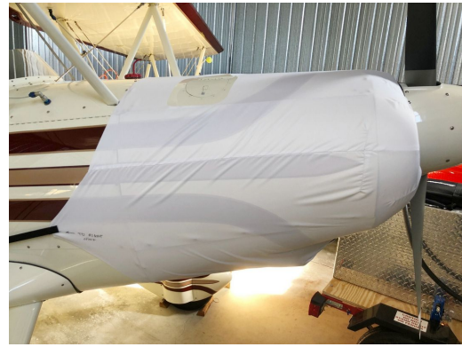
Marquardt Charger Insulated Engine Cover (test fit cover_