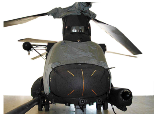
Boeing Vertol CH-47 Forward Cabin & Rotor Hub Cover