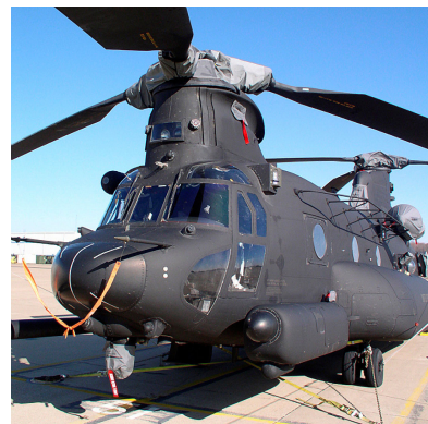
Boeing Vertol MH-47 Rotor Hubs, Engine & Other Covers