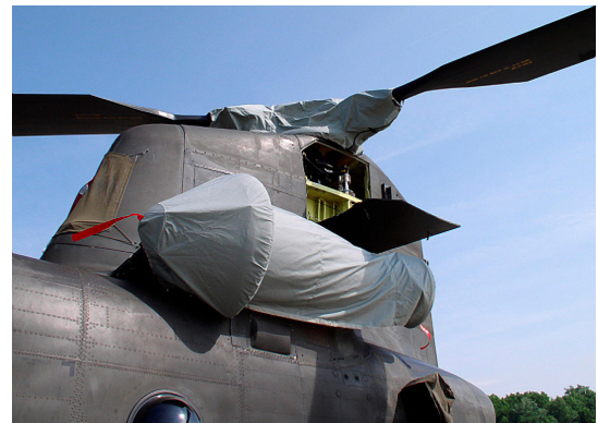
Boeing Vertol CH-47 Engine and Rotor Hub Covers