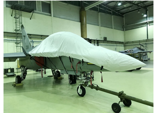
Alenia Aermacchi M-346 Canopy/Nose Cover