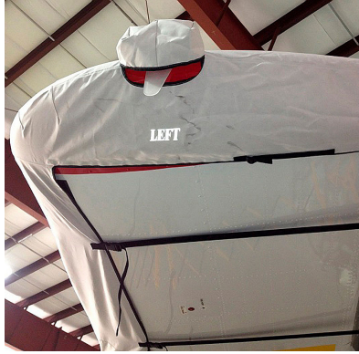
De Havilland Twin Otter Wing Cover wing tip detail

WINTER USE MATERIAL - Made with Solution-Dyed Polyester fabric, this option is intended for seasonal use to aid in deicing, rain mitigation, or for occasional travel. The material is lighter and more compact, but more susceptible to UV damage and may have a shorter useful life if used continuously outside than the all-year use material.