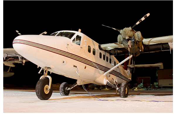
De Havilland Twin Otter Insulated Engine & Insulated Propellor/Spinner Covers Twin Otter Wing, Horiz. Stab & Engine Covers