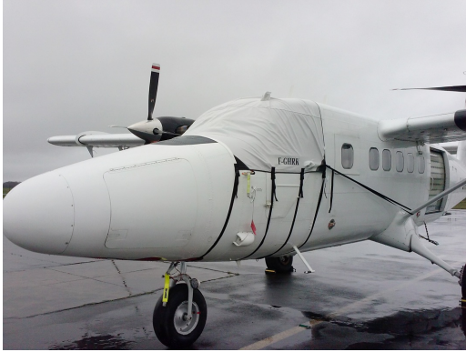
Twin Otter Cockpit Cover

This cover type is made from Silver Acrylic Sunbrella canvas and is 100% lined with a soft and smooth microfiber. Bruce's Custom Covers developed this material combination especially for aircraft protection. The outer material is medium weight and treated for water resistance, UV resistance and anti-static buildup. The inner lining is a very soft and smooth microfiber to prevent scratching. The material is very reflective, and tests show that the cabin interior temperature can be reduced to near-ambient temperature on the hottest of days. It is water, ice and snow repellent, yet breathable to allow moisture to escape from between the cover and the aircraft surface.