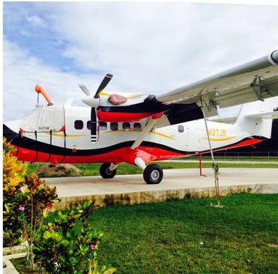
Twin Otter Cockpit Cover & Engine Plugs