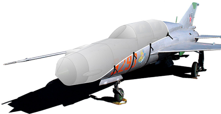
Mig 21 Canopy/Nose Cover