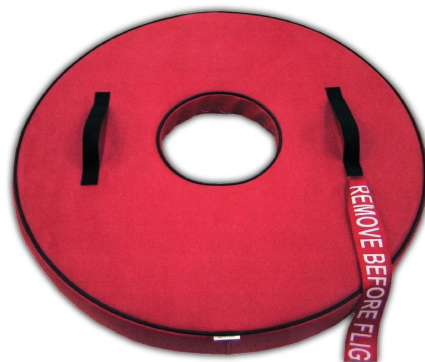
Mig 21 Intake Plug

The Engine Inlet Plugs are custom fit for your Mikoyan Mig 21 intakes, made with heavy-duty vinyl material, and stuffed with a single block of sculpted urethane foam. Each plug has a zipper that allows the foam to be removed and dried if necessary. Engine plugs have 'remove before flight' streamers sewn onto the face of the plugs. Most plugs are imprinted with the aircraft registration number in black for an extra charge. Storage bag NOT included. Engine plugs may be inserted after flight when the engine is still warm. Engine Inlet Plugs are commonly referred to as Cowl Plugs, Intake Plugs, Cowl Blocks, Engine Blocks, and Engine Bungs.