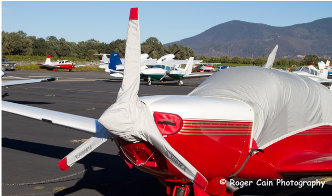
Mooney M20M Bravo 3-Blade Prop Cover, Engine Plugs

Engine Inlet Plugs are custom fit for your Mooney M20V Acclaim Ultra intakes, made with heavy-duty vinyl material, and stuffed with a single block of sculpted urethane foam. Each plug has a zipper that allows the foam to be removed and dried if necessary. Engine plugs have warning flags that are visible from the cockpit or 'remove before flight' streamers sewn onto the face of the plugs. Most plugs are imprinted with the aircraft registration number in black for an extra charge. Storage bag NOT included. Engine plugs may be inserted after flight when the engine is still warm. Engine Inlet Plugs are commonly referred to as Cowl Plugs, Intake Plugs, Cowl Blocks, Engine Blocks, and Engine Bunges.