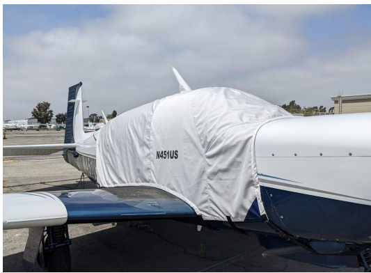
Mooney Ovation Extended Canopy Cover

This cover type is made from Silver Acrylic Sunbrella canvas and is 100% lined with a soft and smooth microfiber. Bruce's Custom Covers developed this material combination especially for aircraft protection. The outer material is medium weight and treated for water resistance, UV resistance and anti-static buildup. The inner lining is a very soft and smooth microfiber to prevent scratching. The material is very reflective, and tests show that the cabin interior temperature can be reduced to near-ambient temperature on the hottest of days. It is water, ice and snow repellent, yet breathable to allow moisture to escape from between the cover and the aircraft surface.