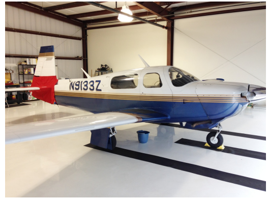
Mooney Tailcone Cover