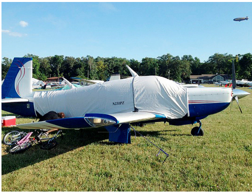
Mooney 231 Extended Canopy Cover

This cover type is made from Silver Acrylic Sunbrella canvas and is 100% lined with a soft and smooth microfiber. Bruce's Custom Covers developed this material combination especially for aircraft protection. The outer material is medium weight and treated for water resistance, UV resistance and anti-static buildup. The inner lining is a very soft and smooth microfiber to prevent scratching. The material is very reflective, and tests show that the cabin interior temperature can be reduced to near-ambient temperature on the hottest of days. It is water, ice and snow repellent, yet breathable to allow moisture to escape from between the cover and the aircraft surface.