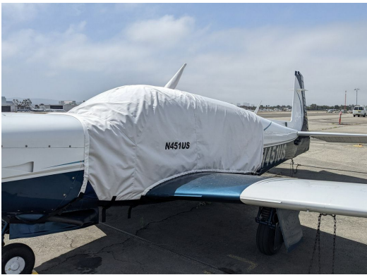
Mooney Ovation Extended Canopy Cover

This cover type is made from Silver Acrylic Sunbrella canvas and is 100% lined with a soft and smooth microfiber. Bruce's Custom Covers developed this material combination especially for aircraft protection. The outer material is medium weight and treated for water resistance, UV resistance and anti-static buildup. The inner lining is a very soft and smooth microfiber to prevent scratching. The material is very reflective, and tests show that the cabin interior temperature can be reduced to near-ambient temperature on the hottest of days. It is water, ice and snow repellent, yet breathable to allow moisture to escape from between the cover and the aircraft surface.