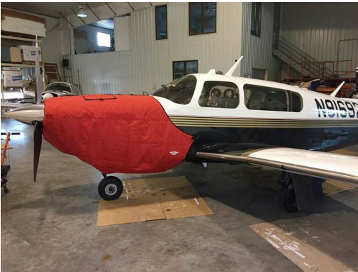
Mooney Ovation Insulated Engine Cover