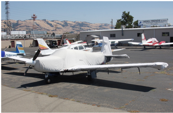
Mooney 231 Full Cover Set