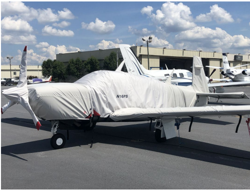
Mooney M20TN Acclaim Full Cover Set