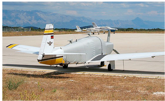
Mooney Extended Canopy/Engine Cover