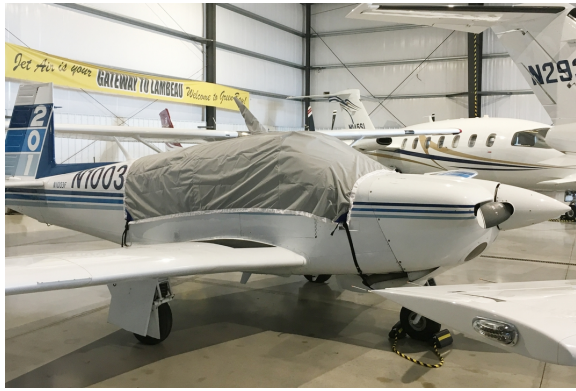
Mooney 201 Travel Cover, Light Weight Travel Canopy Cover, 5 Lbs