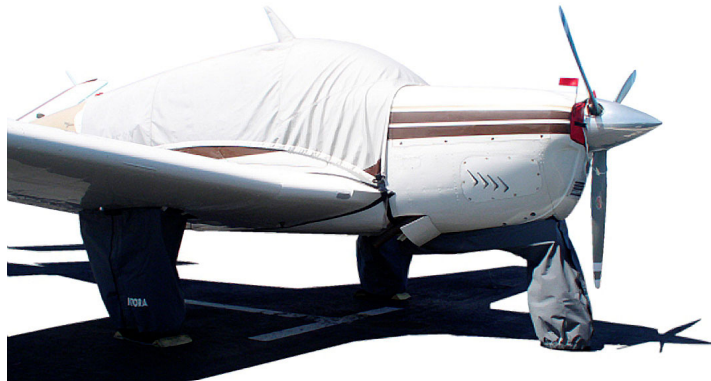
Beech Bonanza/Debonair/Baron Landing Gear Covers