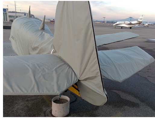
Mooney 231 Full Cover Set: Extra Extended Canopy/Engine Cover, Wing Covers, and Empennage Cover