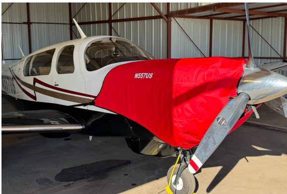
Mooney M20M, Insulated Engine Cover, doesn't cover gear well

This cover type is made from Silver Acrylic Sunbrella canvas and is 100% lined with a soft and smooth microfiber. Bruce's Custom Covers developed this material combination especially for aircraft protection. The outer material is medium weight and treated for water resistance, UV resistance and anti-static buildup. The inner lining is a very soft and smooth microfiber to prevent scratching. The material is very reflective, and tests show that the cabin interior temperature can be reduced to near-ambient temperature on the hottest of days. It is water, ice and snow repellent, yet breathable to allow moisture to escape from between the cover and the aircraft surface.