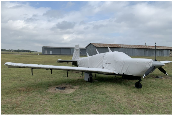
Mooney M20M Bravo Cover Set