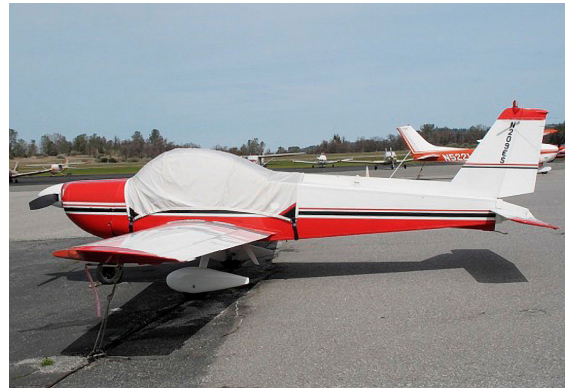
Messerschmitt BO-209 Monsun Canopy Cover