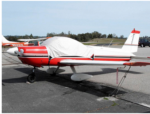
Messerschmitt BO-209 Monsun Canopy Cover