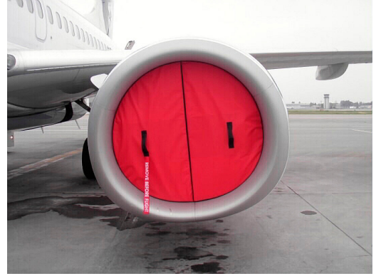
Boeing 737 Engine Intake Plug, Folding Type