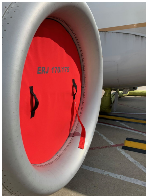
Embraer EMB-170/175 Engine Inlet Plugs

The Engine Inlet Plugs are custom fit for your Embraer EMB-170/175 intakes, made with heavy-duty vinyl material, and stuffed with a single block of sculpted urethane foam. Each plug has a zipper that allows the foam to be removed and dried if necessary. Engine plugs have 'remove before flight' streamers sewn onto the face of the plugs. Most plugs are imprinted with the aircraft registration number in black for an extra charge. Storage bag NOT included. Engine plugs may be inserted after flight when the engine is still warm. Engine Inlet Plugs are commonly referred to as Cowl Plugs, Intake Plugs, Cowl Blocks, Engine Blocks, and Engine Bungs.