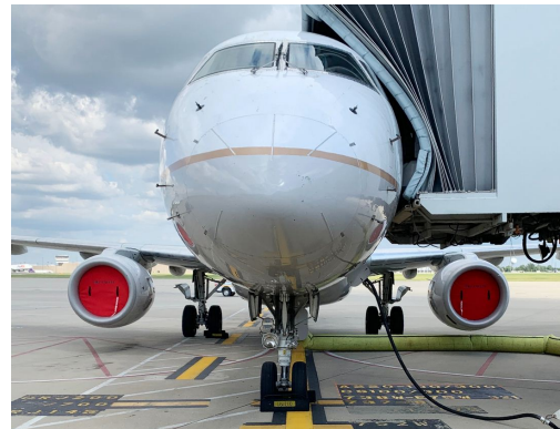
Embraer EMB-170/175 Engine Inlet Plugs