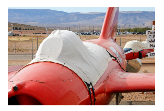
Mikoyan Mig 17 Canopy Cover