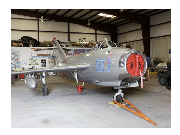
Mig 17 Intake Plug