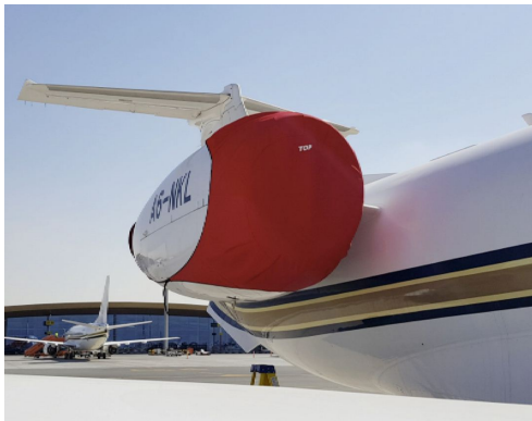
Embraer ERJ-135/140/145 Legacy 650 3-Strap Intake/Exhaust Cover

The Embraer ERJ-135/140/145 Legacy 600, 650 Intake Covers are designed to install easily yet be completely storable. A spring steel hoop is sewn into the hem of each cover, allowing them to be installed without climbing onto the wing or using a stepladder. To store the covers the spring steel hoop folds like a band-saw blade into three nesting rings. Each cover folds into a compact circular bundle which is stored in the included duffle bag, yet they unfold quickly for use. The Tri-Fold Ring cover is made of medium weight nylon which is available in a variety of colors to match the paint trim. Each cover set comes complete with installation and folding instructions. The aircraft's registration number can be silkscreened onto the cover for an extra charge.