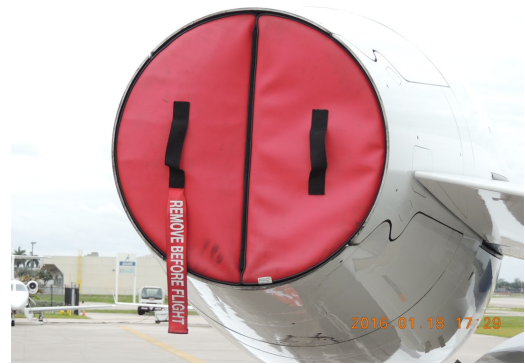
Embraer Legacy 500 Engine Exhaust Plug, folding type