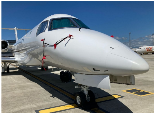
Embraer ERJ-135 Pitot/TAT/Ice Detector Covers

The Engine Inlet Plugs are custom fit for your Embraer ERJ-135/140/145 Legacy 600, 650 intakes, made with heavy-duty vinyl material, and stuffed with a single block of sculpted urethane foam. Each plug has a zipper that allows the foam to be removed and dried if necessary. Engine plugs have 'remove before flight' streamers sewn onto the face of the plugs. Most plugs are imprinted with the aircraft registration number in black for an extra charge. Storage bag NOT included. Engine plugs may be inserted after flight when the engine is still warm. Engine Inlet Plugs are commonly referred to as Cowl Plugs, Intake Plugs, Cowl Blocks, Engine Blocks, and Engine Bungs.