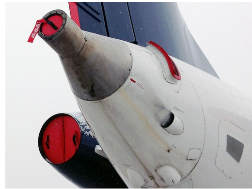
Embraer Legacy 650 APU and Engine Exhaust Plugs