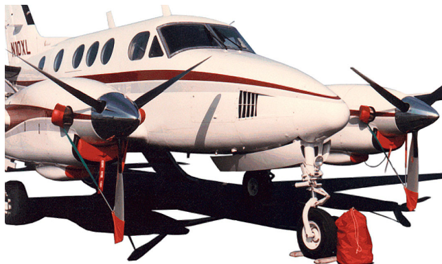
Pitot, Exhaust Covers, Engine Plugs & Prop Ties

Engine Inlet Plugs are custom fit for your Embraer Bandeirante EMB110 intakes, made with heavy-duty vinyl material, and stuffed with a single block of sculpted urethane foam. Each plug has a zipper that allows the foam to be removed and dried if necessary. Engine plugs have warning flags that are visible from the cockpit or 'remove before flight' streamers sewn onto the face of the plugs. Most plugs are imprinted with the aircraft registration number in black for an extra charge. Storage bag NOT included. Engine plugs may be inserted after flight when the engine is still warm. Engine Inlet Plugs are commonly referred to as Cowl Plugs, Intake Plugs, Cowl Blocks, Engine Blocks, and Engine Bunges.