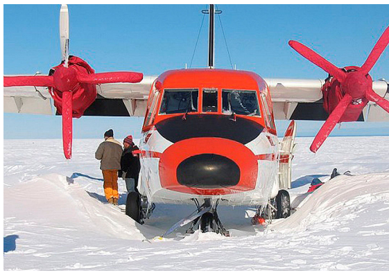
Casa 212 Insulated Engine & Propellor/Spinner Covers