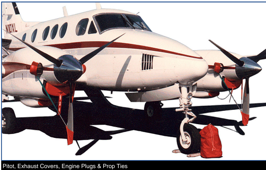
Pitot, Exhaust Covers, Engine Plugs &amp; Prop Ties