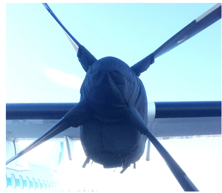
ATR-72-202 Insulated Engine & Prop Hub Covers