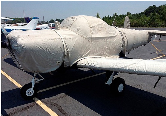
Ercoupe full cover set: Extended Canopy, Engine, Wing & Empennage covers

WINTER USE MATERIAL - Made with Solution-Dyed Polyester fabric, this option is intended for seasonal use to aid in deicing, rain mitigation, or for occasional travel. The material is lighter and more compact, but more susceptible to UV damage and may have a shorter useful life if used continuously outside than the all-year use material.