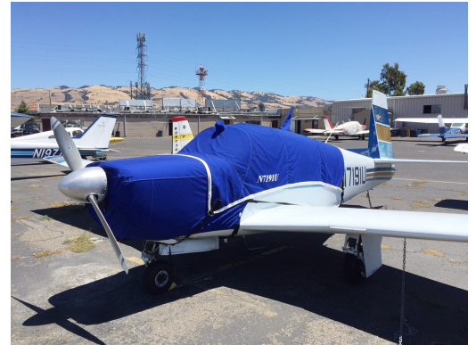
Mooney M20 Canopy & Engine Cover