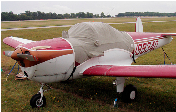
Ercoupe Canopy Cover, flat windshield model