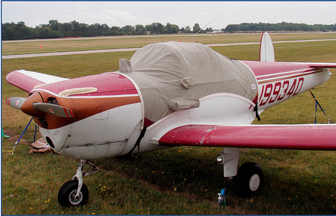
Ercoupe Canopy Cover, flat windshield model