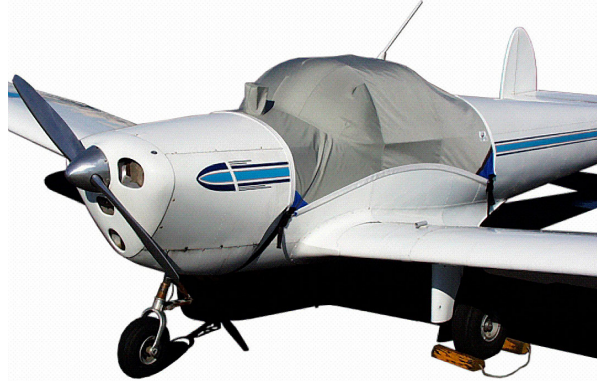
Ercoupe Canopy Cover, bubble windshield model

Travel Covers are made with Silver Solution-Dyed Polyester fabric and only lined over the windshield to save weight. The material is lightweight and more compact for easy stowage in the aircraft. The polyester material is water resistant, but only intended for occasional use outside. We also have an ultra lightweight material available for fitted hangar dust covers. For daily outdoor use, the non-travel Sunbrella Cover is the best choice.