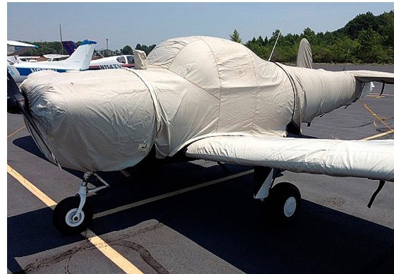
Ercoupe Canopy Cover, bubble windshield model Ercoupe full cover set: Extended Canopy, Engine, Wing & Empennage covers