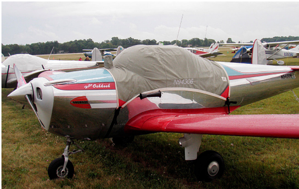
Ercoupe Canopy Cover, flat windshield model

the Canopy Cover and Engine Cover. This cover will enclose the engine cowl and will extend aft to cover all of the windows. This cover type is made from Silver Acrylic Sunbrella canvas and is 100% lined with a soft and smooth microfiber. Bruce's Custom Covers developed this material combination especially for aircraft protection. The outer material is medium weight and treated for water resistance, UV resistance and anti-static buildup. The inner lining is a very soft and smooth microfiber to prevent scratching. The material is very reflective, and tests show that the cabin interior temperature can be reduced to near-ambient temperature on the hottest of days. It is water, ice and snow repellent, yet breathable to allow moisture to escape from between the cover and the aircraft surface.