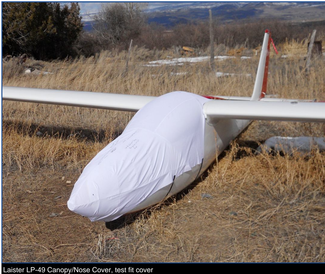
Laister LP-49 Canopy/Nose Cover, test fit cover