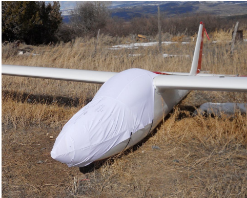
Laister LP-49 Canopy/Nose Cover, test fit cover

water resistance, UV resistance and anti-static buildup. The inner lining is a very soft and smooth microfiber to prevent scratching. The material is very reflective, and tests show that the cabin interior temperature can be reduced to near-ambient temperature on the hottest of days. It is water, ice and snow repellent, yet breathable to allow moisture to escape from between the cover and the aircraft surface.