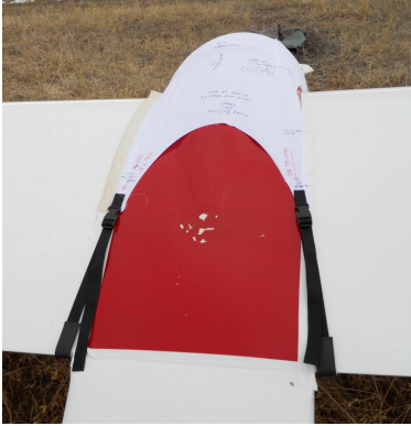
Laister LP-49 Canopy/Nose Cover, test fit cover

water resistance, UV resistance and anti-static buildup. The inner lining is a very soft and smooth microfiber to prevent scratching. The material is very reflective, and tests show that the cabin interior temperature can be reduced to near-ambient temperature on the hottest of days. It is water, ice and snow repellent, yet breathable to allow moisture to escape from between the cover and the aircraft surface.