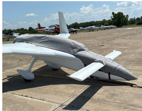
Rutan Long-EZ Canopy/Nose/Engine Cover, Travel Weight