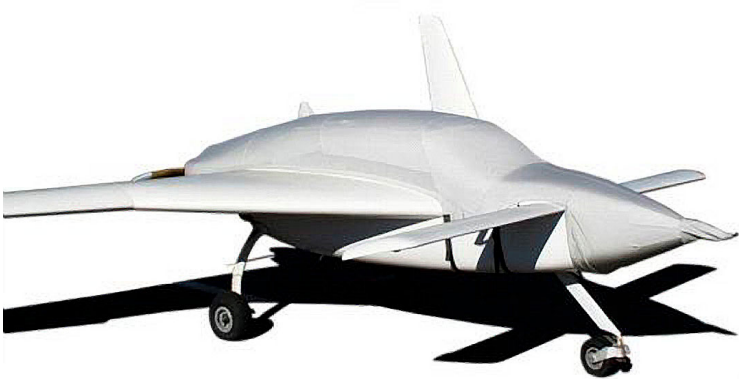
Velocity Canopy/Nose/Engine Cover

This cover type is made from Silver Acrylic Sunbrella canvas and is 100% lined with a soft and smooth microfiber. Bruce's Custom Covers developed this material combination especially for aircraft protection. The outer material is medium weight and treated for water resistance, UV resistance and anti-static buildup. The inner lining is a very soft and smooth microfiber to prevent scratching. The material is very reflective, and tests show that the cabin interior temperature can be reduced to near-ambient temperature on the hottest of days. It is water, ice and snow repellent, yet breathable to allow moisture to escape from between the cover and the aircraft surface.