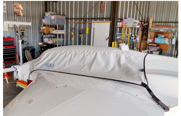
Rutan Long-EZ Canopy/Nose Cover