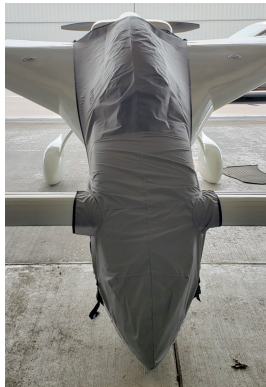
Rutan Long-EZ & Berkut Travel Cover, Light Weight Canopy/Nose Cover

Travel Covers are made with Silver Solution-Dyed Polyester fabric and only lined over the windshield to save weight. The material is lightweight and more compact for easy stowage in the aircraft. The polyester material is water resistant, but only intended for occasional use outside. We also have an ultra lightweight material available for fitted hangar dust covers. For daily outdoor use, the non-travel Sunbrella Cover is the best choice.