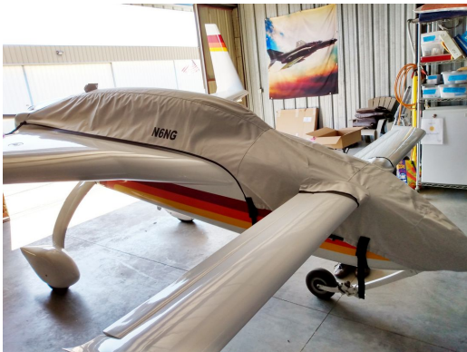
Rutan Long-EZ Canopy/Nose Cover

Travel Covers are made with Silver Solution-Dyed Polyester fabric and only lined over the windshield to save weight. The material is lightweight and more compact for easy stowage in the aircraft. The polyester material is water resistant, but only intended for occasional use outside. We also have an ultra lightweight material available for fitted hangar dust covers. For daily outdoor use, the non-travel Sunbrella Cover is the best choice.