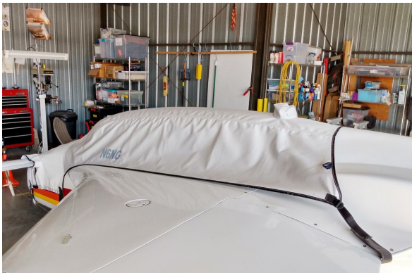
Rutan Long-EZ Canopy/Nose Cover