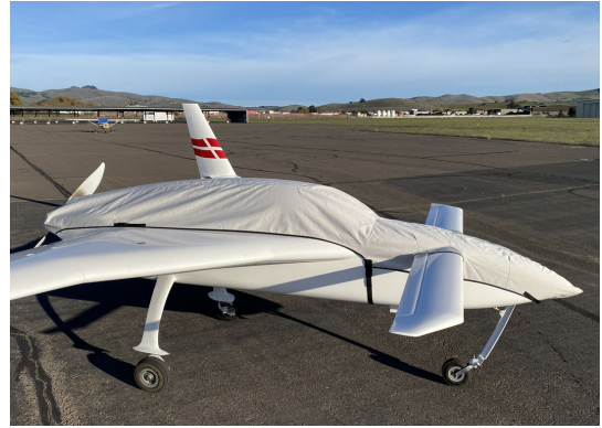
Rutan Long-EZ Canopy/Nose/Engine Cover