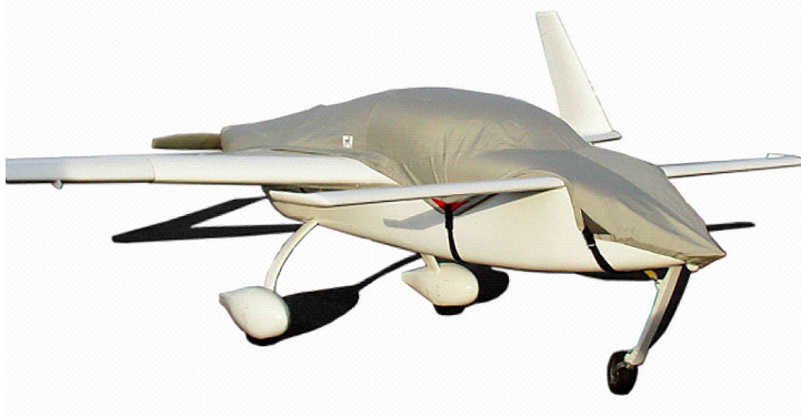
Cozy III Canopy/Nose/Engine Cover

This cover type is made from Silver Acrylic Sunbrella canvas and is 100% lined with a soft and smooth microfiber. Bruce's Custom Covers developed this material combination especially for aircraft protection. The outer material is medium weight and treated for water resistance, UV resistance and anti-static buildup. The inner lining is a very soft and smooth microfiber to prevent scratching. The material is very reflective, and tests show that the cabin interior temperature can be reduced to near-ambient temperature on the hottest of days. It is water, ice and snow repellent, yet breathable to allow moisture to escape from between the cover and the aircraft surface.