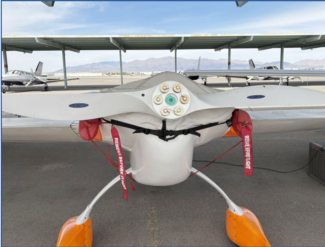
Long-EZ Canopy/Nose/Engine Cover