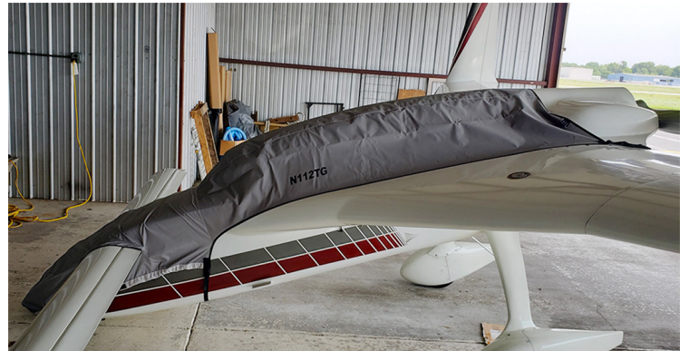
Rutan Long-EZ & Berkut Travel Cover, Light Weight Canopy/Nose Cover