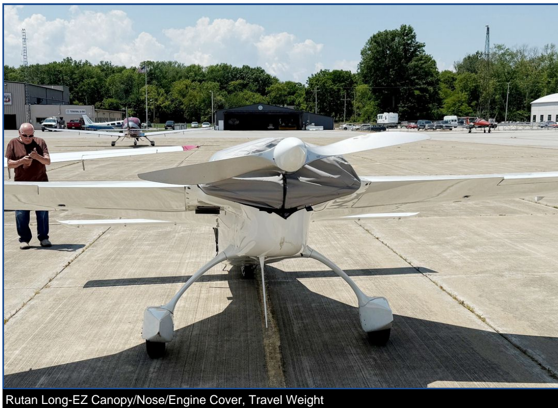
Rutan Long-EZ Canopy/Nose/Engine Cover, Travel Weight