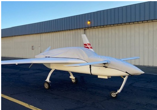
Rutan Long-EZ Canopy/Nose/Engine Cover

This cover type is made from Silver Acrylic Sunbrella canvas and is 100% lined with a soft and smooth microfiber. Bruce's Custom Covers developed this material combination especially for aircraft protection. The outer material is medium weight and treated for water resistance, UV resistance and anti-static buildup. The inner lining is a very soft and smooth microfiber to prevent scratching. The material is very reflective, and tests show that the cabin interior temperature can be reduced to near-ambient temperature on the hottest of days. It is water, ice and snow repellent, yet breathable to allow moisture to escape from between the cover and the aircraft surface.