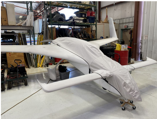
Rutan Long-EZ Canopy/Nose/Engine Cover

This cover type is made from Silver Acrylic Sunbrella canvas and is 100% lined with a soft and smooth microfiber. Bruce's Custom Covers developed this material combination especially for aircraft protection. The outer material is medium weight and treated for water resistance, UV resistance and anti-static buildup. The inner lining is a very soft and smooth microfiber to prevent scratching. The material is very reflective, and tests show that the cabin interior temperature can be reduced to near-ambient temperature on the hottest of days. It is water, ice and snow repellent, yet breathable to allow moisture to escape from between the cover and the aircraft surface.