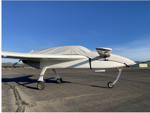
Rutan Long-EZ Canopy/Nose/Engine Cover

Travel Covers are made with Silver Solution-Dyed Polyester fabric and only lined over the windshield to save weight. The material is lightweight and more compact for easy stowage in the aircraft. The polyester material is water resistant, but only intended for occasional use outside. We also have an ultra lightweight material available for fitted hangar dust covers. For daily outdoor use, the non-travel Sunbrella Cover is the best choice.