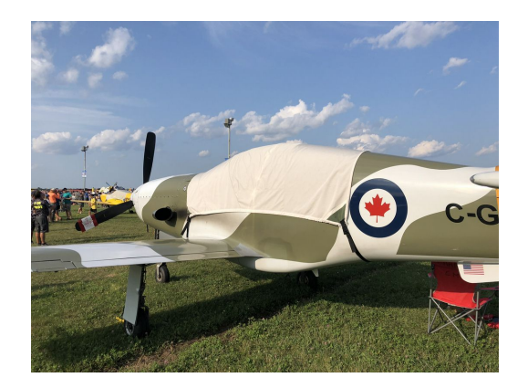
Turbine Legend Canopy Cover