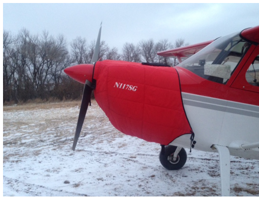
Bellanca Citabria Insulated Engine Cover