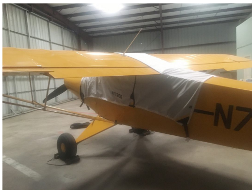
Legend AL18 Canopy Cover, Over Top Type

This cover type is made from Silver Acrylic Sunbrella canvas and is 100% lined with a soft and smooth microfiber. Bruce's Custom Covers developed this material combination especially for aircraft protection. The outer material is medium weight and treated for water resistance, UV resistance and anti-static buildup. The inner lining is a very soft and smooth microfiber to prevent scratching. The material is very reflective, and tests show that the cabin interior temperature can be reduced to near-ambient temperature on the hottest of days. It is water, ice and snow repellent, yet breathable to allow moisture to escape from between the cover and the aircraft surface.