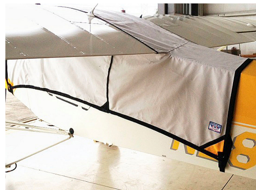
Legend Cub Over-Top Canopy Cover