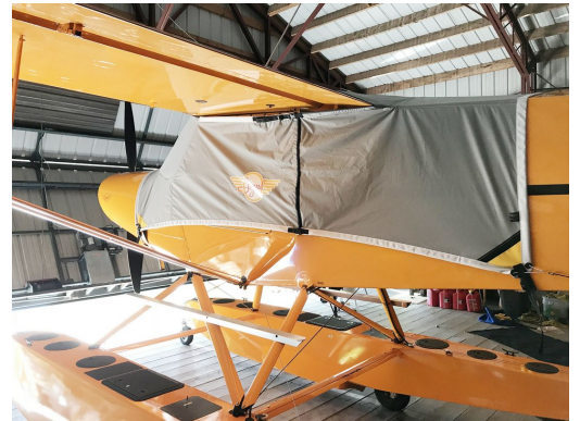
Legend Cub Light Weight Travel Cover