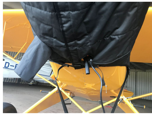
Legend Cub AL3 Insulated Engine Cover