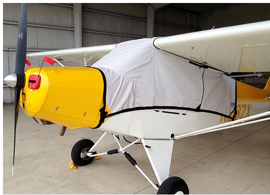
Legend Cub Over-Top Canopy Cover and Engine Plugs