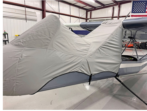
AirCam Gen 2 Travel Cover, Light weight travel canopy/nose cover