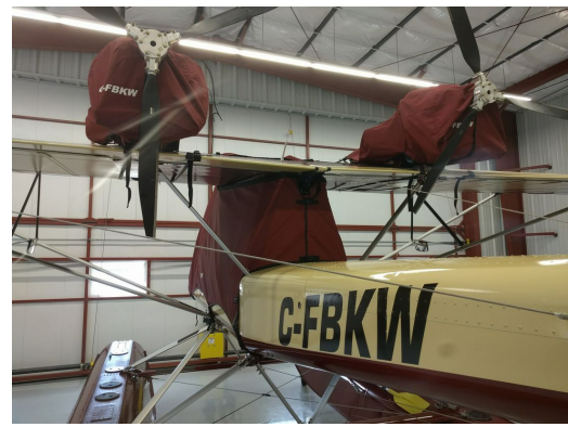
Lockwood Air Cam Canopy Cover, enclosed cockpit style, & Engine Covers