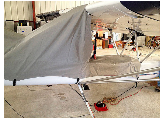
Lockwood AirCam Lightweight Travel Canopy/Nose Cover w/ aft baggage compartment ext