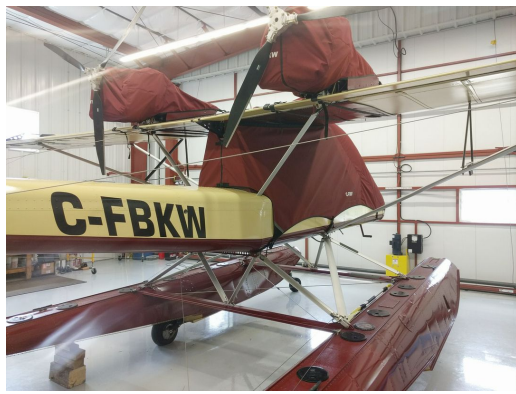
Lockwood AirCam Canopy Cover (fully enclosed bubble), Engine Covers