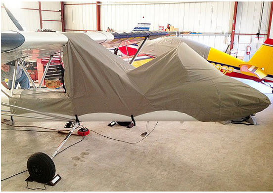
Lockwood AirCam Lightweight Travel Canopy/Nose Cover w/ aft baggage compartment ext