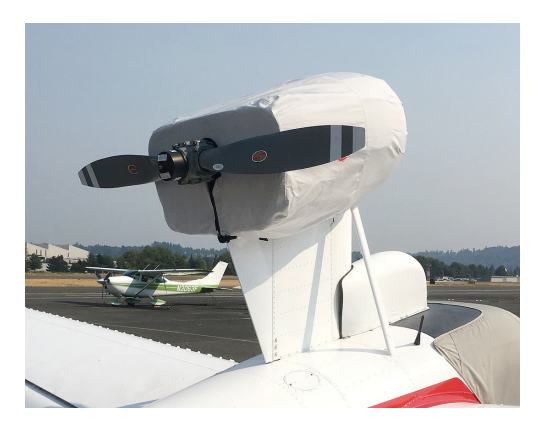
Lake LA250 Renegade Cockpit Cover, Engine Cover (test fit)