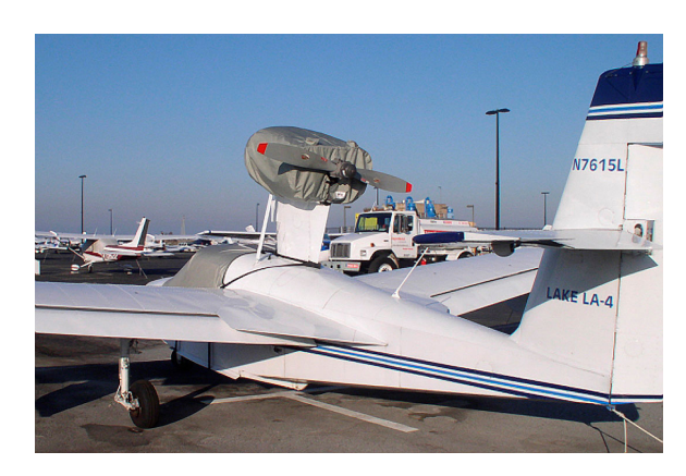
Lake Canopy & Engine Covers