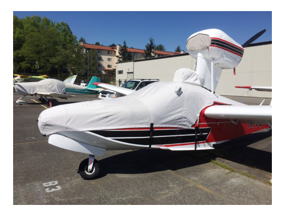
Lake LA-4 Canopy/Nose Cover

This cover type is made from Silver Acrylic Sunbrella canvas and is 100% lined with a soft and smooth microfiber. Bruce's Custom Covers developed this material combination especially for aircraft protection. The outer material is medium weight and treated for water resistance, UV resistance and anti-static buildup. The inner lining is a very soft and smooth microfiber to prevent scratching. The material is very reflective, and tests show that the cabin interior temperature can be reduced to near-ambient temperature on the hottest of days. It is water, ice and snow repellent, yet breathable to allow moisture to escape from between the cover and the aircraft surface.