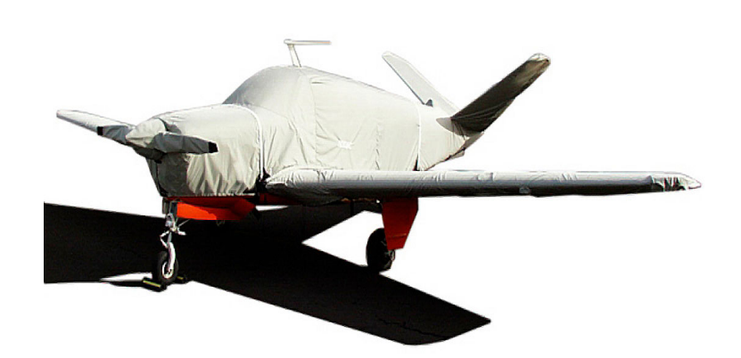
Beech Bonanza Full Cover Set