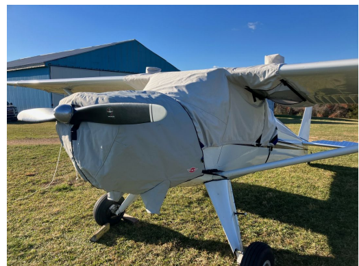
Luscombe 8A Canopy Cover, Insulated Engine Cover