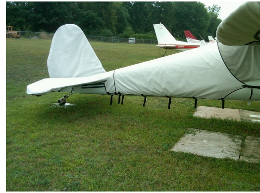
Luscombe Empennage Cover, two-piece design