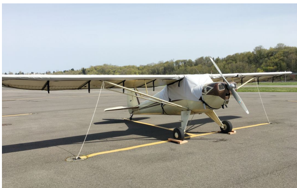
Luscombe Over-Top Canopy Cover & Wing Covers

This cover type is made from Silver Acrylic Sunbrella canvas and is 100% lined with a soft and smooth microfiber. Bruce's Custom Covers developed this material combination especially for aircraft protection. The outer material is medium weight and treated for water resistance, UV resistance and anti-static buildup. The inner lining is a very soft and smooth microfiber to prevent scratching. The material is very reflective, and tests show that the cabin interior temperature can be reduced to near-ambient temperature on the hottest of days. It is water, ice and snow repellent, yet breathable to allow moisture to escape from between the cover and the aircraft surface.