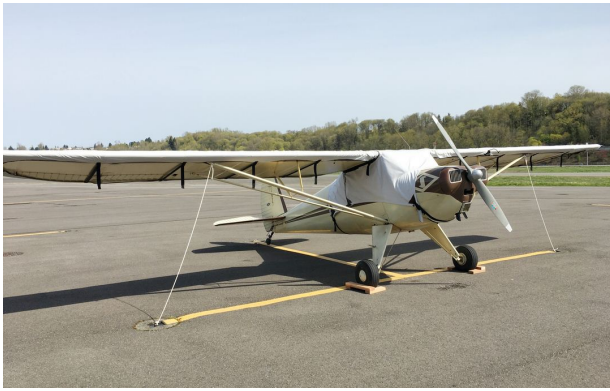
Luscombe Over-Top Canopy Cover & Wing Covers