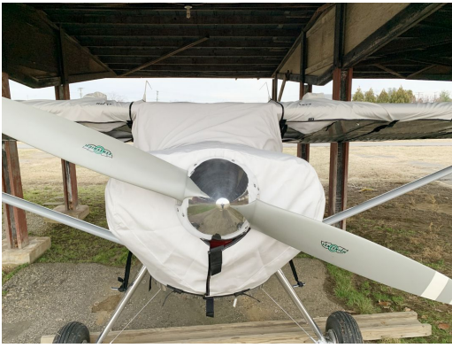
Luscombe Engine, Canopy & Wing Covers