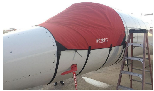
Learjet 45 Cockpit Cover