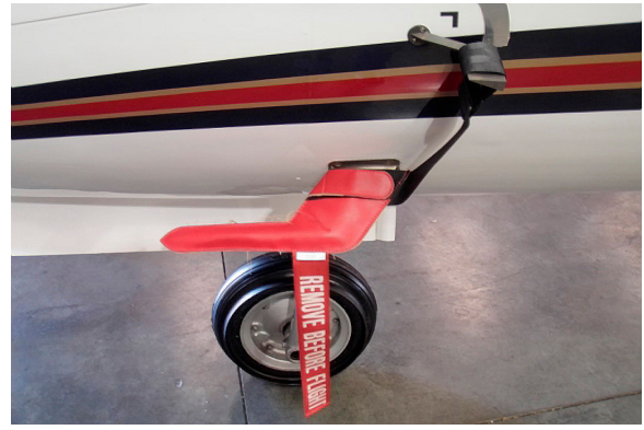
Learjet Heat Resistant Pitot Cover and AOA Strap