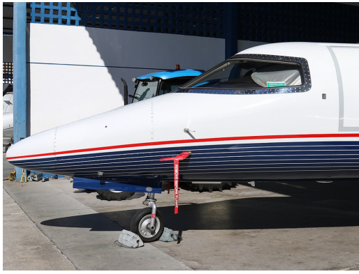
Lear Pitot Cover