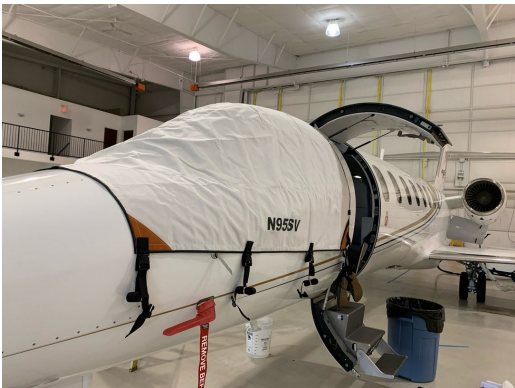
Lear 70 Cockpit Cover