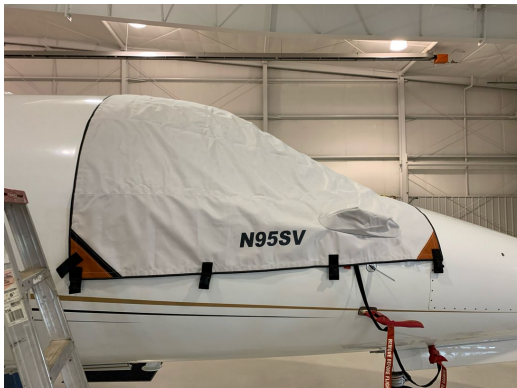
Lear 70 Cockpit Cover

This cover type is made from Silver Acrylic Sunbrella canvas and is 100% lined with a soft and smooth microfiber. Bruce's Custom Covers developed this material combination especially for aircraft protection. The outer material is medium weight and treated for water resistance, UV resistance and anti-static buildup. The inner lining is a very soft and smooth microfiber to prevent scratching. The material is very reflective, and tests show that the cabin interior temperature can be reduced to near-ambient temperature on the hottest of days. It is water, ice and snow repellent, yet breathable to allow moisture to escape from between the cover and the aircraft surface.