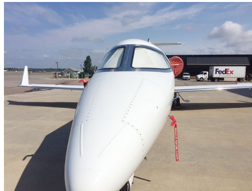
Lear Models 40 & 45 Cockpit Heatshields, Covers All Cockpit Windows

Cockpit Heatshields are interior sunshades for the aircraft's cockpit. The product is a unique composite of closed-cell foam with a silver mylar finish. The semi-rigid design is stiff enough to stand inside the window framing. The set folds up flat and is easily stored in the included storage sleeve. Some designs may require velcro and suction cups. Our Heatshields for jets are offered white side out because some aircraft manufacturers have issued advisories against reflective window inserts due to potential heat damage. A Heatshield is an excellent short-term remedy for cockpit overheating, but an external fabric cover is more effective for long-term protection.