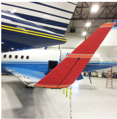
Falcon 2000 Winglet Pad