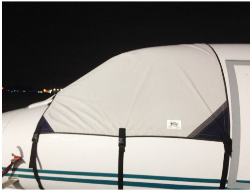
Lear 31 Cockpit Cover