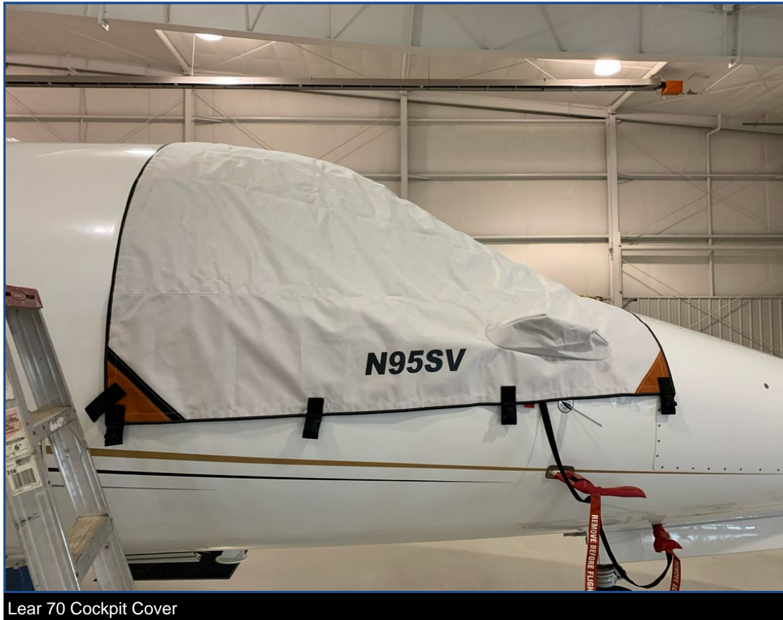
Lear 70 Cockpit Cover