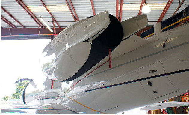
Lear 60 "Bikini Style" Engine Covers

The Lear Models 70 & 75 Bikini Style Engine Covers are a single-piece design using a soft and smooth stretchy and fabric. The cover stretches tightly over both the intake and exhaust, installing quickly and easily. These covers are designed to be used as hangar dust covers and have a useful life of approximately one year.