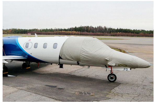
Learjet Cockpit/Nose Cover