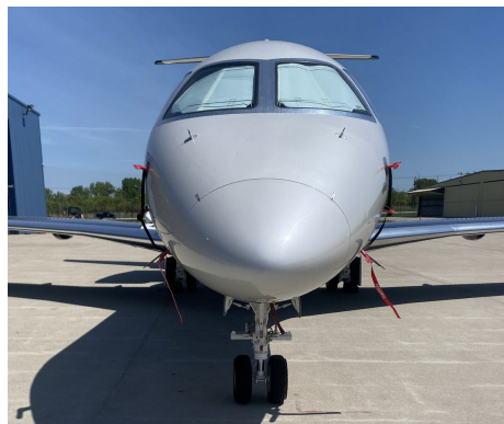
Embraer S A EMB-545 Pitot Cover Set, Cockpit HeatShields

Cockpit Heatshields are interior sunshades for the aircraft's cockpit. The product is a unique composite of closed-cell foam with a silver mylar finish. The semi-rigid design is stiff enough to stand inside the window framing. The set folds up flat and is easily stored in the included storage sleeve. Some designs may require velcro and suction cups. Our Heatshields for jets are offered white side out because some aircraft manufacturers have issued advisories against reflective window inserts due to potential heat damage. A Heatshield is an excellent short-term remedy for cockpit overheating, but an external fabric cover is more effective for long-term protection.