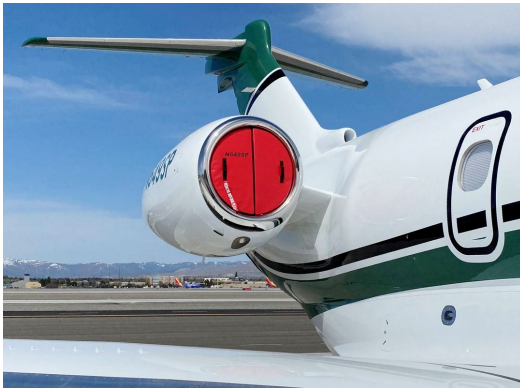
Embraer S A EMB-545 Engine Inlet & Exhaust Plug Set (folding type)

The Engine Inlet Plugs are custom fit for your Embraer Legacy 500 Praetor, (EMB-545/550) intakes, made with heavy-duty vinyl material, and stuffed with a single block of sculpted urethane foam. Each plug has a zipper that allows the foam to be removed and dried if necessary. Engine plugs have 'remove before flight' streamers sewn onto the face of the plugs. Most plugs are imprinted with the aircraft registration number in black for an extra charge. Storage bag NOT included. Engine plugs may be inserted after flight when the engine is still warm. Engine Inlet Plugs are commonly referred to as Cowl Plugs, Intake Plugs, Cowl Blocks, Engine Blocks, and Engine Bungs.