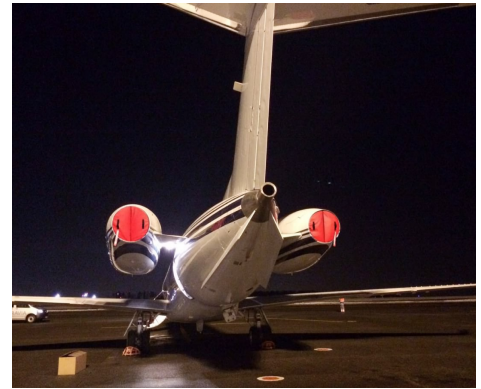
Embraer Legacy Exhaust Plugs