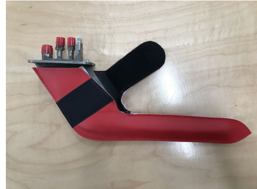
Lear 55 Pitot Cover