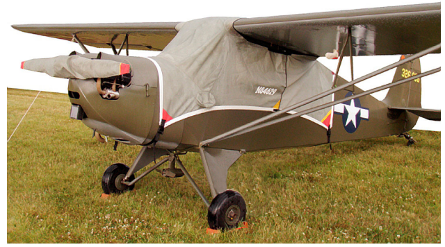
L3 Canopy Cover & Prop Cover