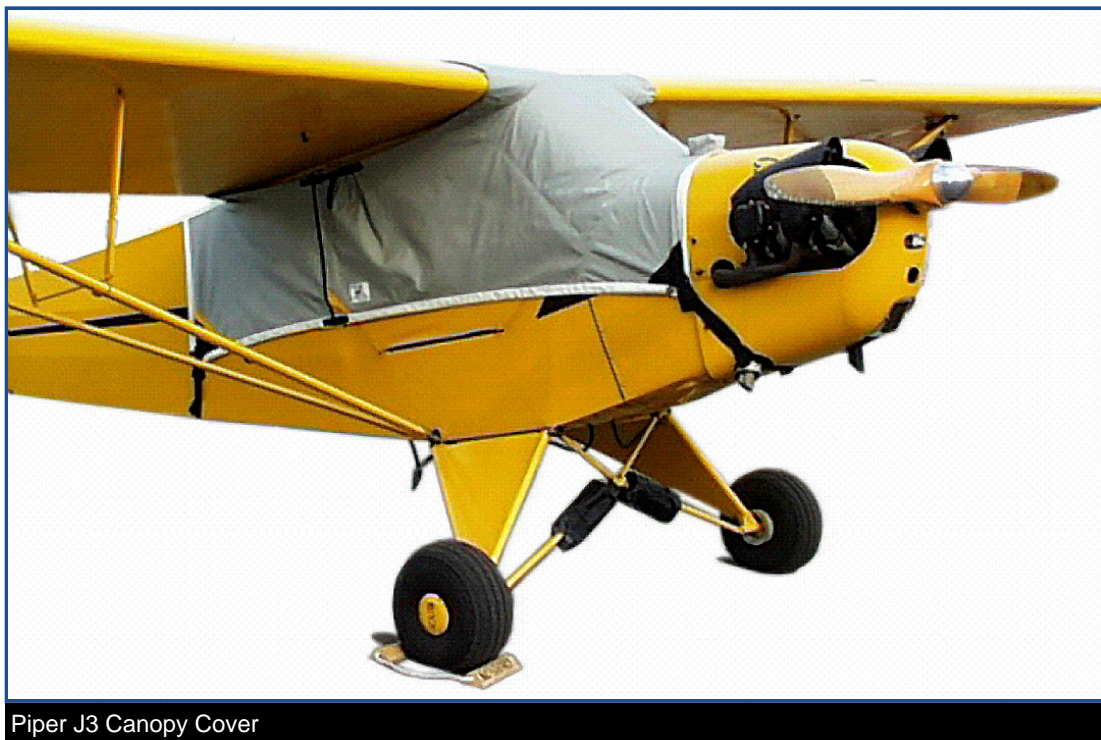
Piper J3 Canopy Cover