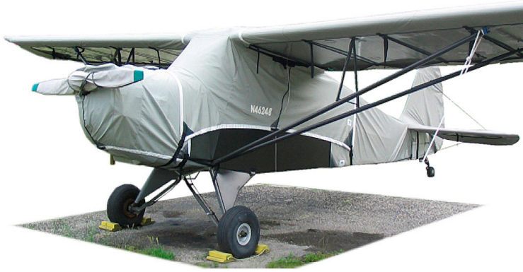
Prop Cover, Engine Cover, Canopy Cover, Wing Covers and Empennage Cover