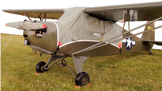
L3 Canopy Cover & Prop Cover