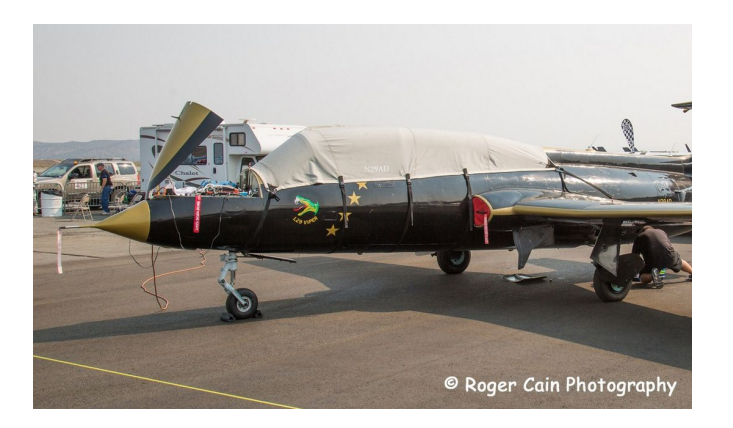
Aero L-29 Canopy Cover