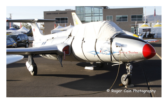
Aero L-29 Canopy Cover, Engine Plugs