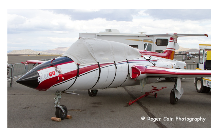
Aero L-29 Canopy Cover, Engine Plugs