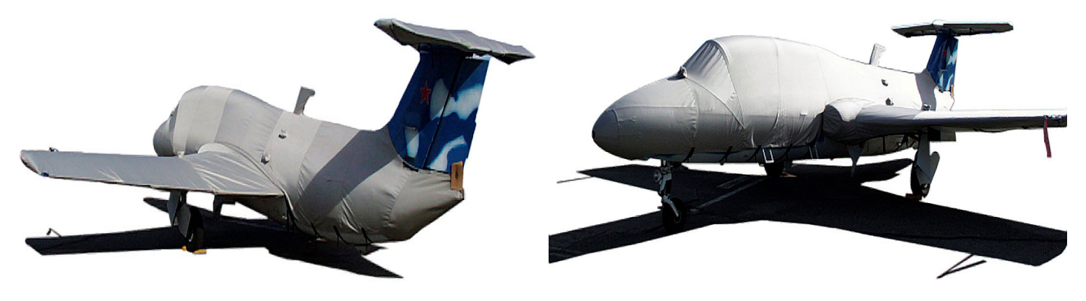
Fuselage, Wings & Horizontal Stabilizer Cover

mitigation, or for occasional travel. The material is lighter and more compact, but more susceptible to UV damage and may have a shorter useful life if used continuously outside than the all-year use material.