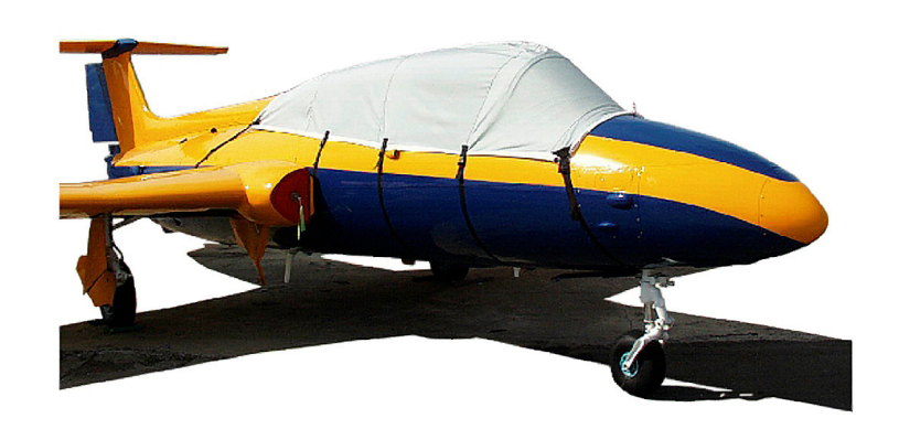
Canopy Cover for the L-29 Delfin Maya

Travel Covers are made with Silver Solution-Dyed Polyester fabric and only lined over the windshield to save weight. The material is lightweight and more compact for easy stowage in the aircraft. The polyester material is water resistant, but only intended for occasional use outside. We also have an ultra lightweight material available for fitted hangar dust covers. For daily outdoor use, the non-travel Sunbrella Cover is the best choice.