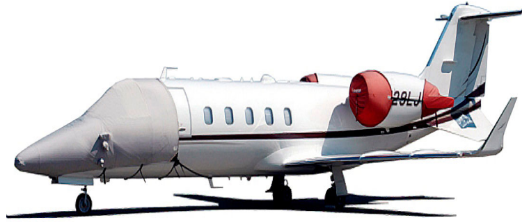
Lear 45 Windshield/Nose & Engine Cover Set