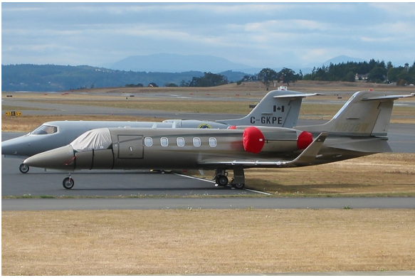
Lear 31A Cockpit Cover, Engine Covers