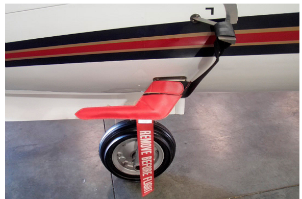
Learjet Heat Resistant Pitot Cover and AOA Strap