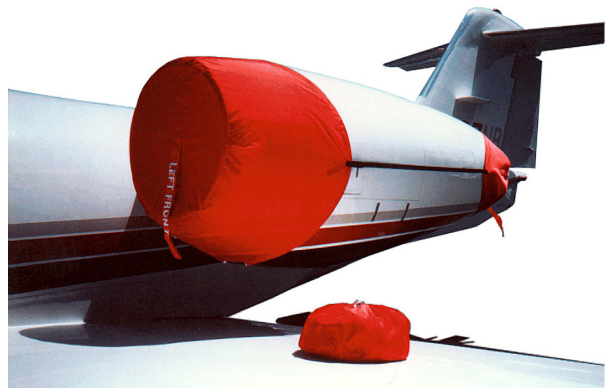
Lear 35 Engine Covers