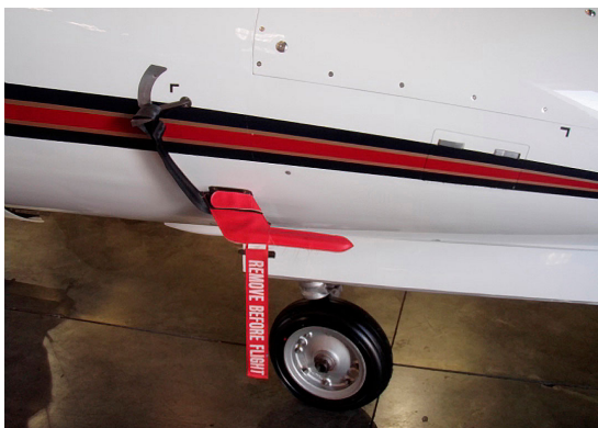
Learjet Heat Resistant Pitot Cover with AOA strap

The Engine Inlet Plugs are custom fit for your Lear 24 & 25 intakes, made with heavy-duty vinyl material, and stuffed with a single block of sculpted urethane foam. Each plug has a zipper that allows the foam to be removed and dried if necessary. Engine plugs have 'remove before flight' streamers sewn onto the face of the plugs. Most plugs are imprinted with the aircraft registration number in black for an extra charge. Storage bag NOT included. Engine plugs may be inserted after flight when the engine is still warm. Engine Inlet Plugs are commonly referred to as Cowl Plugs, Intake Plugs, Cowl Blocks, Engine Blocks, and Engine Bungs.