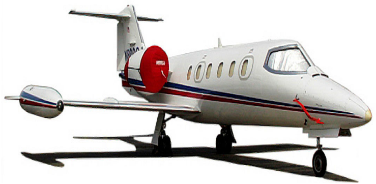
Lear 35 Engine Covers, Pitot Covers & Cockpit HeatShields